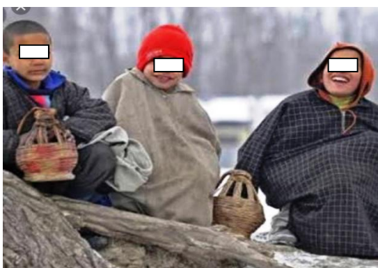
Fig. 7. Body warming by Chinar charcoal