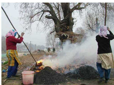
Fig. 3. Charcoal making