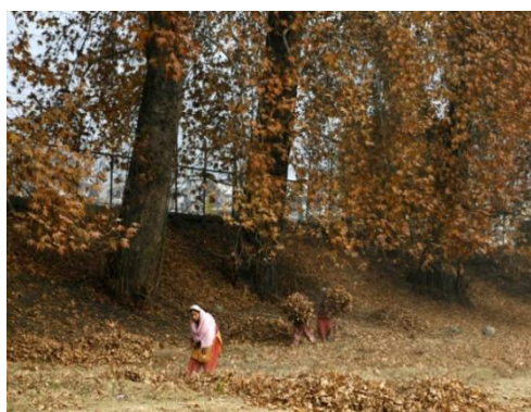
Fig. 1. Collection of Chinar leaf litter