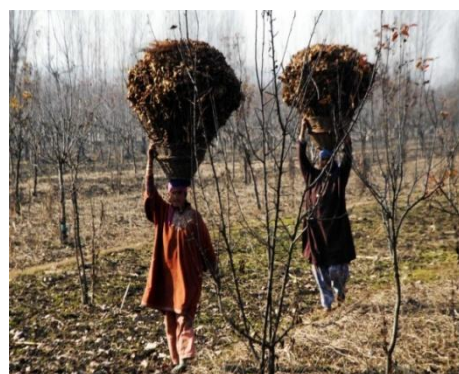
Fig. 2. Packing and transportation