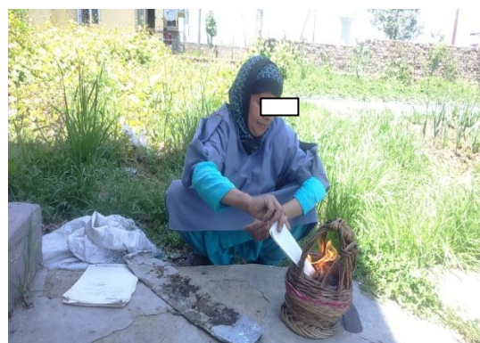
Fig. 6. Kangri burning with charcoal