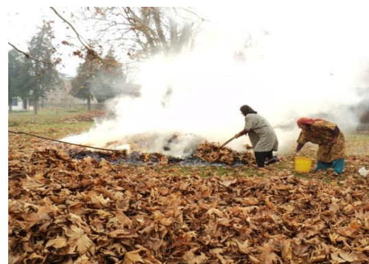
Fig. 8. Drudgery of women in charcoal burning