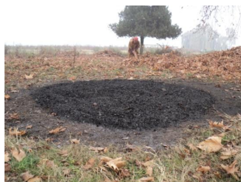
Fig. 4. Drying of Chinar charcoal