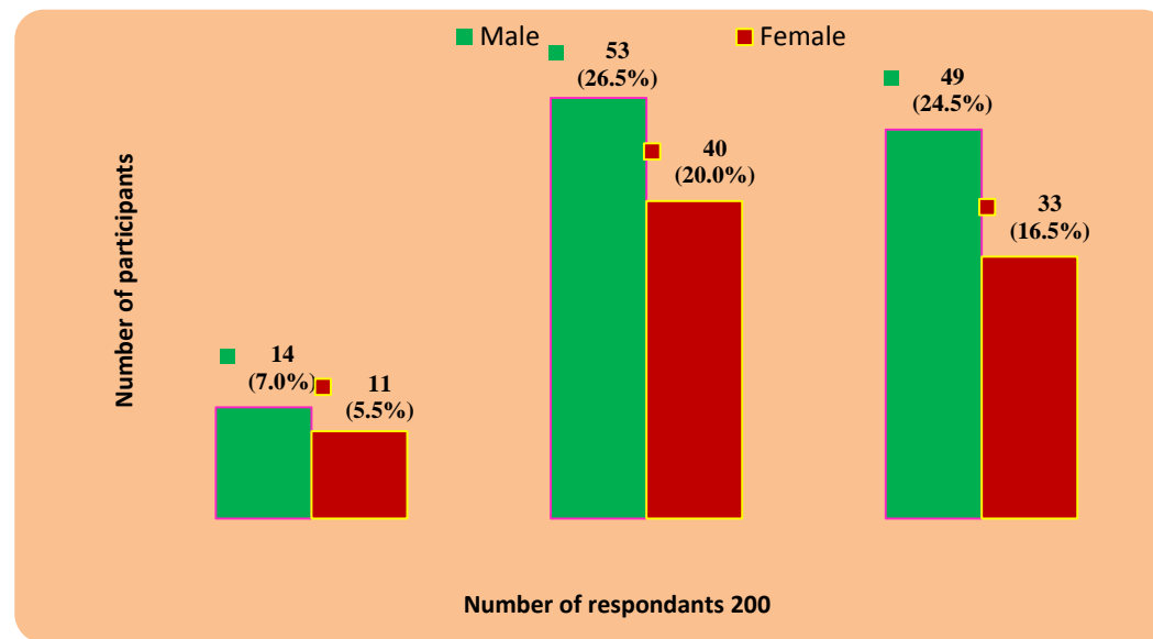
Fig. 1. Gender- wise level of opinion towards training programmes of all the four KVKs

Figures in parentheses indicate percentages; M= Male, F= Female