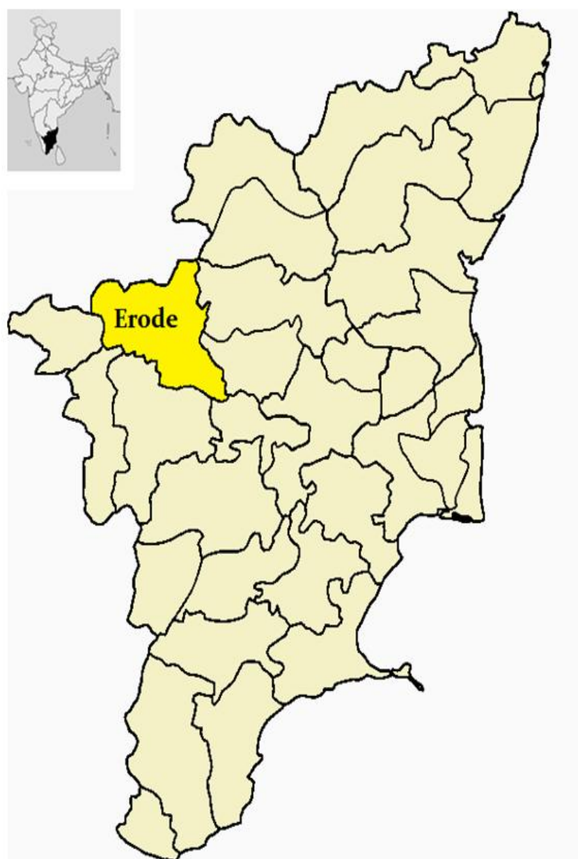
Fig. 1. Map Showing the Study Area

annual income, farm size, experience in turmeric cultivation, social participation and mass media exposure were found to be non- significant. Among the significant variables, three variables namely educational status, innovativeness and scientific orientation were found to be significant at one per cent level of probability. The remaining three variables viz., farming experience, extension agency contact and trainings undergone were found to be significant at five per cent level of probability. Individual variable wise discussion is given in subsequent headings.