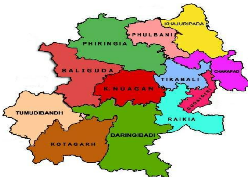
Fig. 1. District map of Kandhamal District, Odisha