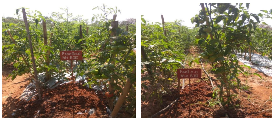
Fig. 7. Tomato (HeemSohna) crop with and without mulch in open field conditions