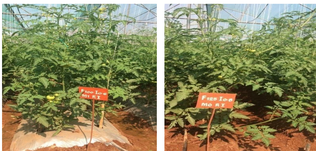
Fig. 6. Tomato (HeemSohna) crop with and without mulch in shadenet