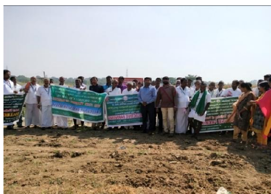
Fig. 15. Farmers from different states across the country visits PFDC Hyderabad research and demonstration fields to gain practical knowledge on Precision Farming Techniques.