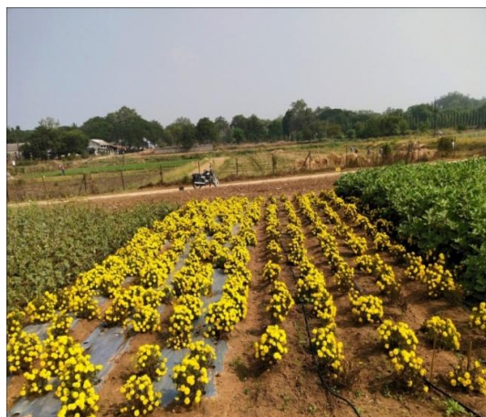
Fig. 3. Marigold with and without mulch, Demonstration plots, PFDC, Hyderabad