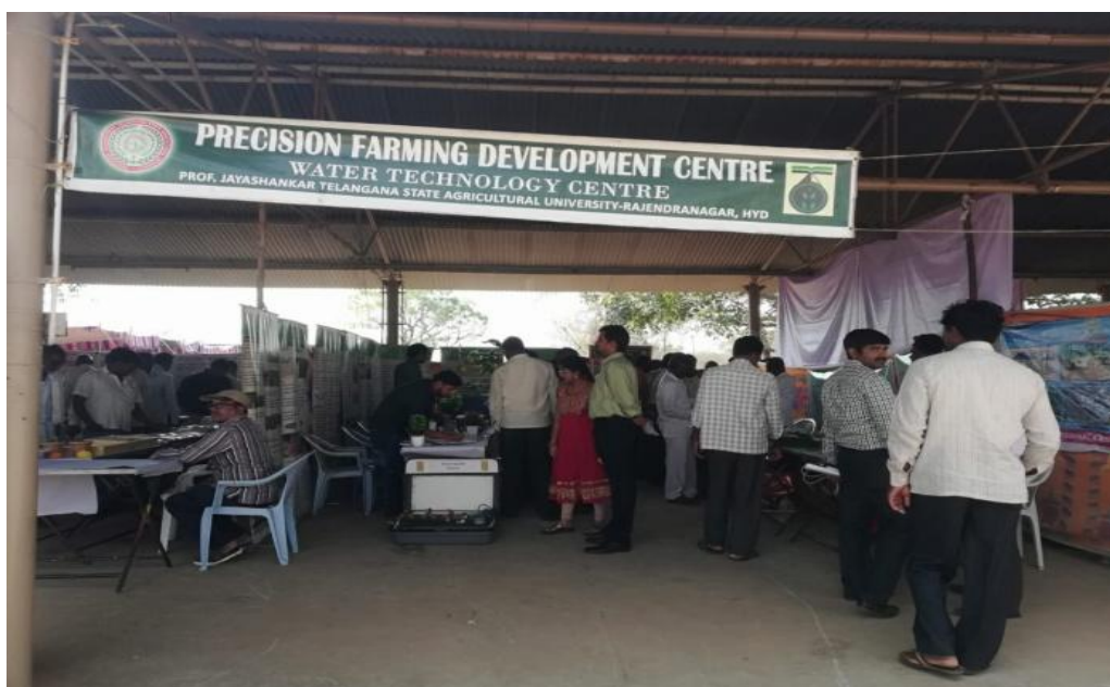
Fig. 4. PFDC, Hyderabad participated in Kisan Mela 2019 at KVK, CRIDA, Hayathnagar, Telangana, India, On 16-02-2019. Around 200 farmers, officials visited PFDC stall