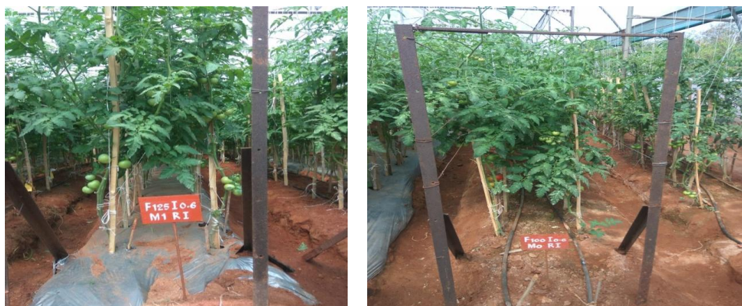
Fig. 5. Tomato (HeemSohna) crop with and without mulch in poly house