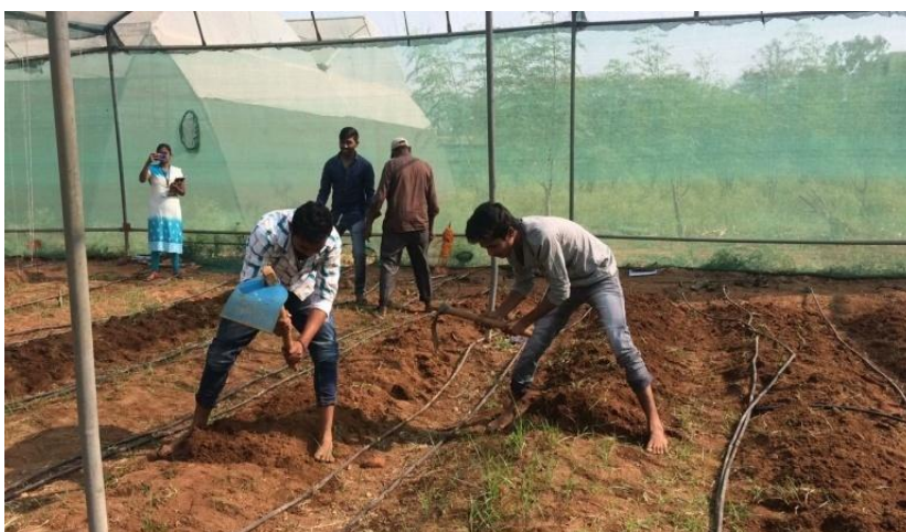
Fig. 1. Hands on training Bed preparation carried out by trainees during practical classes

During rabi 2017-18, the highest fresh fruit yield ( 164.87 \text{ t ha}^{-1} ) ( 16.49 \text{ kg m}^{-2} ) was recorded by tomato (Heem Sohna) (sum of 17 pickings) with application of 100% recommended dose of fertilizers ( 150-60-80 \text{ kg N-P}_2\text{O}_5\text{-K}_2\text{O ha}^{-1} ) at I_{0.8} irrigation level without any mulch followed by application of 100% Recommended Dose of Fertilizer (RDF) at I_{0.6} irrigation level without mulch ( 157.96 \text{ t ha}^{-1} , 15.80 \text{ kg m}^{-2} ). Response to mulch (25 microns, dual coloured, black and silver) was not noticed under poly house conditions.