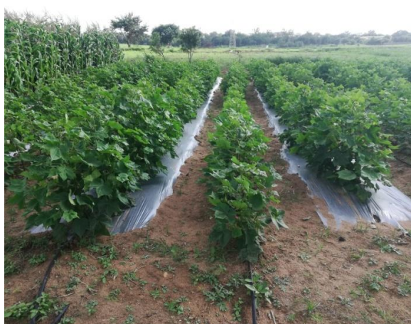
Fig. 2. Cotton with and without mulch, Demonstration plots, PFDC, Hyderabad