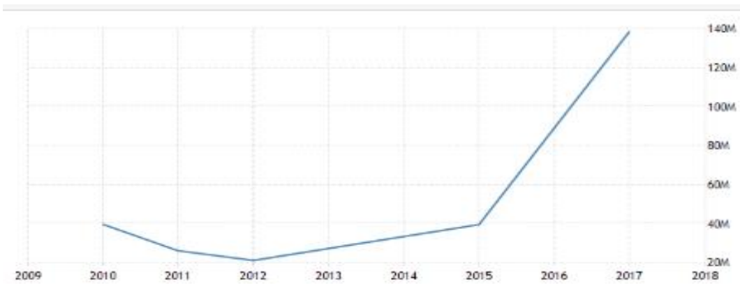
Fig. 1. Sudan exports of Cotton

In 2017, Sudan exports of cotton were US$138.27 million, according to the database of UN COMTRADE on the international trade.