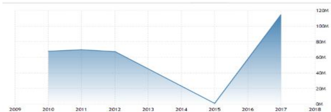
Fig. 3. Sudan exports of Gum, lac and resins

According to the COMTRADE database of united nations on international trade, Sudan exports of oilseed, fruits, oleagic and grain was US$607.45 million in 2017.