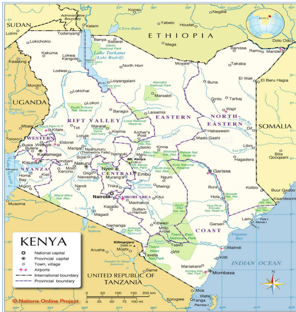
Fig. 1. Map showing the Western Region of Kenya