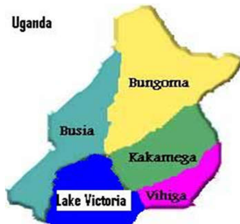
Fig. 2. Map showing the counties in the Western Region of Kenya