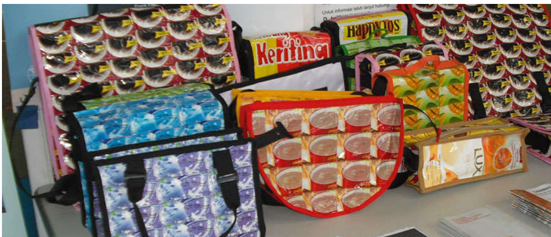
Fig. 1. Creatif products UAP (Uwuh Art Project)

The development of tourism in the Taman Sari Tourism Area in Yogyakarta has had a positive and negative impact on the social culture of the local community. Positive impacts that arise include; preservation of culture, customs, way of life, art, providing employment, and generating economic activities in local communities. While the negative impacts that arise include; the occurrence of cultural upheaval among young people and middle class society.