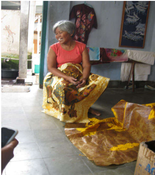
Fig. 2. Image of batik craftsmen