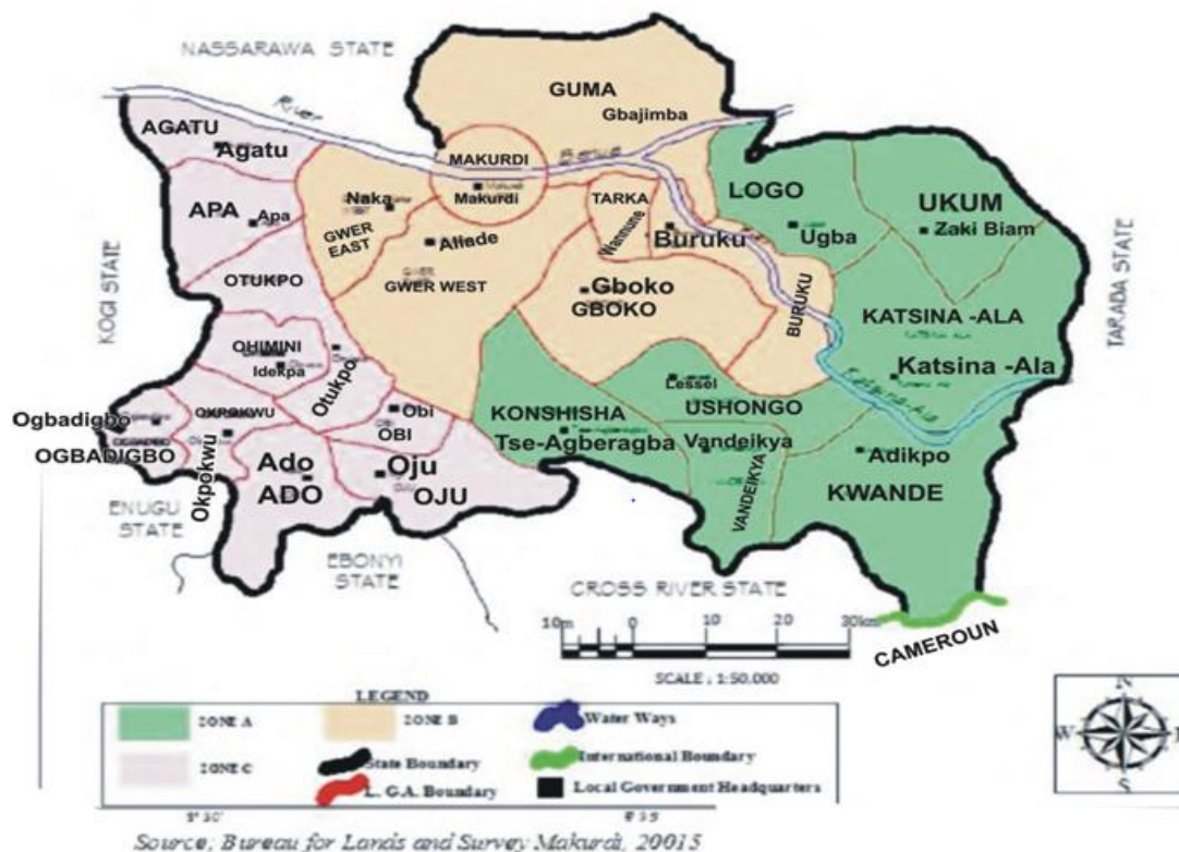
Fig. 1. Map of Benue State showing distribution of local government areas by zones

The population of study consists of all yam farming households in North-East Zone of Benue State, Nigeria made up of seven (7) Local Government Areas. The study purposively selected three (3) local government areas (Ukum, Katsina-Ala and Logo) that are most prominent in yam production in North-East Zone of Benue State. The three Local Government Areas have a total of 1735 yam farming Households [12]. Four (4) council wards were randomly selected from each of the selected local government areas, then seventeen (17) respondents were selected from each of the council wards. This gave a total sample size of two hundred and four (204) respondents. Primary data was obtained from fieldwork using questionnaire and focused group discussion methods. Descriptive statistics were used to achieve the objectives of the study while multiple regression analysis were used to test the hypothesis of the study.