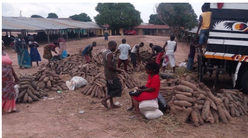
Fig. 3. Loading of yams under the sunlight at Ukum yam market

This finding corroborates the submission of [17] from his assessment of the conflicts between Fulani-herdsmen and farmers in Kwara State of Nigeria that, food crops which were cultivated on about 500 hectares of land with an estimated value of N200 million was burned. This agrees with the position of [18] that, the impact of conflict on agricultural practice, food security and