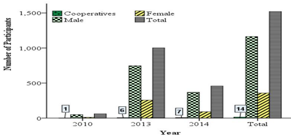
Fig. 3. Number of cooperatives and farmers' participation in seed producing cooperatives south Tigray