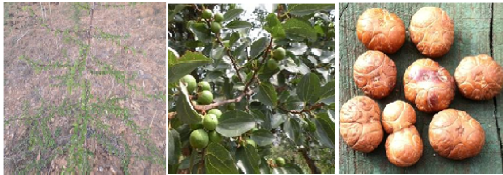
Fig. 1. Plant, fruiting plant, and seed of Bodichitta

The plantation of trees is also in harmony with the ecosystem and hence sustainable. An integrated approach involving plantation of high value crops is required to ensure the sustainability of farming, exemplified in the Kavrepalanchowk district. As Bodichitta is reported to be providing a good source of income for the farmers, there is ample scope and opportunity for sector to be improved and sustained in collaboration with government agencies, non-government organizations (NGOs) and community based organizations (CBOs) to initiate or support local participatory development, research or training program in areas related to Boddhichitta cultivation. Thus, the present study was conducted to develop Boddhichitta cultivation in that particular area by making proper assessment of the factors affecting and the different aspects that are being affected by this so that better livelihood of people could be ensured. The study was carried with the purpose to assess the effect of its cultivation on the socioeconomic status of farmers of the region and probe the probability of the future expansion of its cultivation.