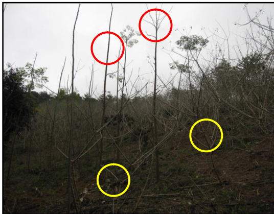
Fig. 2. Melia azedarach +cassava agroforestry system. Yellow circles indicate cassavas and red circles indicate M. azedarach

where, Past V_i is past values of input or income and t is number of years from year 1 to present. IR is interest rate, which was fixed to 10% following local interest rate. All data were collected in 2013.