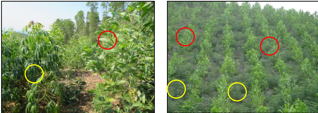
Fig. 3. Acacia hybrid + cassava agroforestry system. Yellow circles indicate cassavas and red circles indicate A. hybrid trees

however, is that these agroforestry systems are often established and expanded through farmers' own efforts without directive or government support, leading to no clear market strategy for agroforestry products [15]. During the establishment, the price of products is high, but usually decreases as a result of oversupply and also because farmers do not have marketing contracts with buyers. In some cases, farmers are not able to sell their products, which led them to abandon or shift their practices. Clearly, agroforestry investment is constrained by lack of stable markets. This issue calls for three important actions by local governments as follows: (i) Mediating between farmers and companies/exporters to develop a clear marketing strategy or agreement; (ii) Facilitating planning with farmers as to the areas that can be legally planted to or converted to agroforestry; and (iii) Providing technical and financial support to farmers [16].