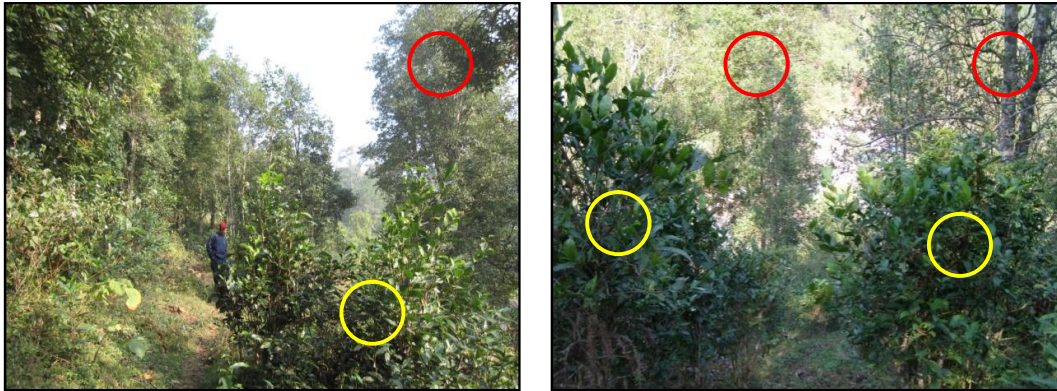
Fig. 1. Illicium verum +tea agroforestry system. Yellow circles indicate teas and red circles indicate I. verum trees