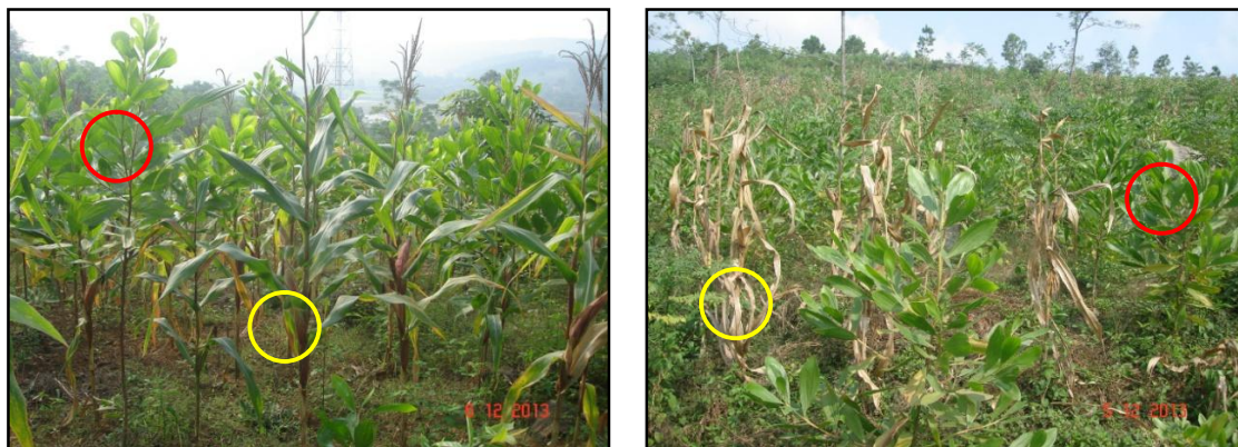
Fig. 4. Acacia mangium + maize agroforestry system. Yellow circles indicate maize and red circles indicate A. mangium trees