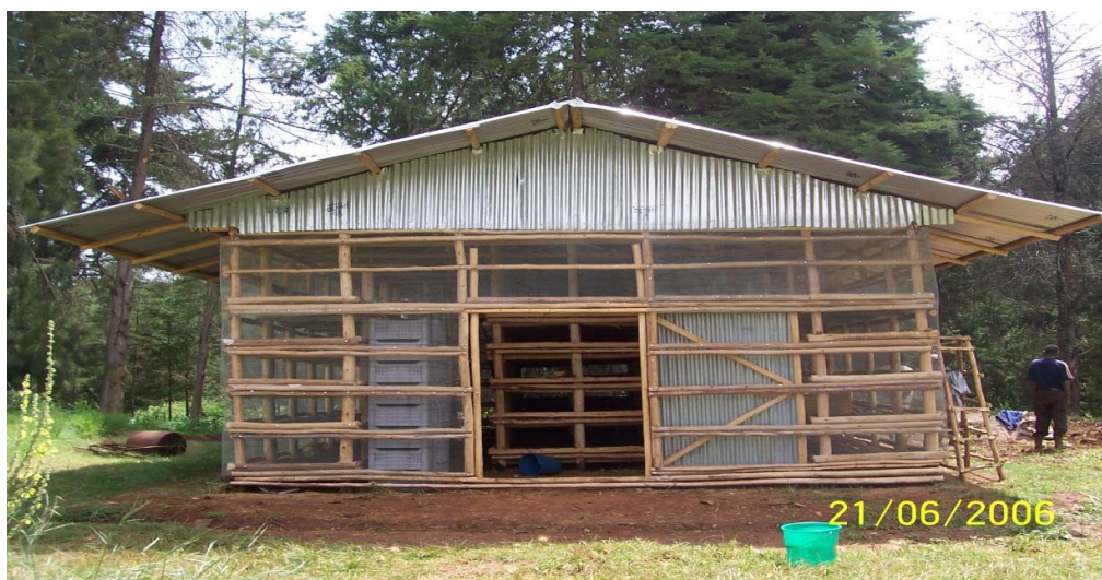
Fig. 2. Diffused light store constructed at Holetta research center

According to the response from farmers, all of them earned better income from the project intervention than yield from local cultivars. During the first year, a quintal of fresh potato tuber for consumption sold at local market fetched 70 birr