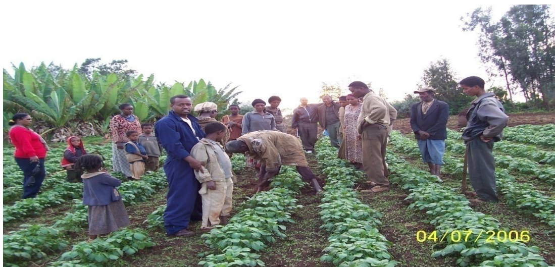
Fig. 1. On spot training and demonstration to women FRG

Group evaluation was conducted among FRG; in which members visited trial sites and status of each farmer's trial field. The most important events observed include sharing of experiences, experts, knowledge, views and surprises among members. During such evaluation, mismanaged