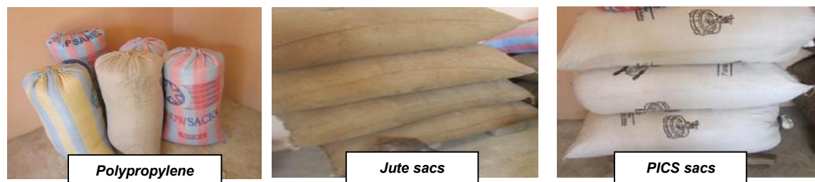
Fig. 1. Different Storage Methods