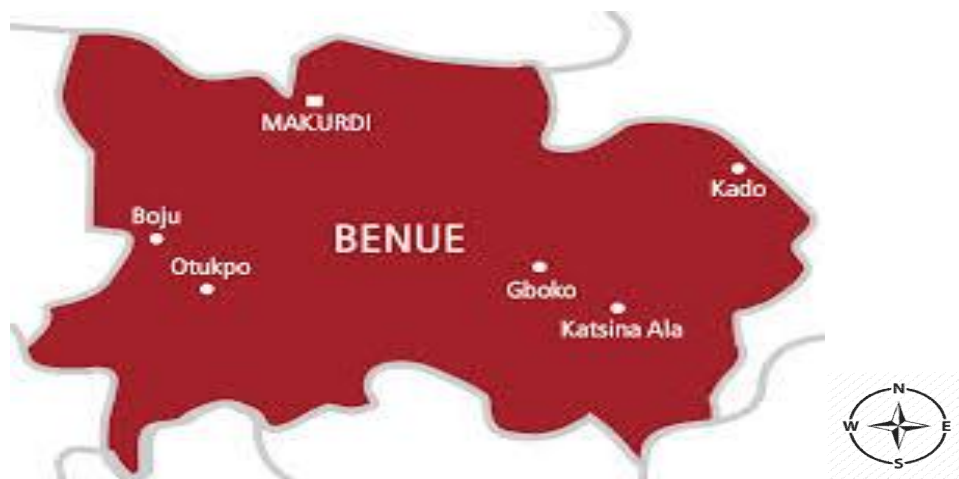
Fig. 1. Map of Benue State, Nigeria

Data were collected on socio-economic characteristics of respondents and UDP technologies disseminated by USAID/MARKETS II Project which include; (1) land preparation (puddling and bund formation) (2) improved rice seeds (FAROs 44, 52, 57 or 61) (3) seed sorting/germination test (4) nursery establishment (wet bed rice nursery) (5) line transplanting (20x20) cm at 1 rice seedling per hill) (6) USG application (40x40) cm per 4 rice stands) (7) harvesting (panicle harvesting). The knowledge level of the UDP technologies were determined by describing in the questionnaire how each technology was expected to be used so that the interviewers could check to ensure the validity of the recorded information. The knowledge level was therefore measured by scoring one point (1) = yes for each technology well explained and used by the respondent and (0) =no, if otherwise. The knowledge level was calculated as the number of UDP technologies well explained and used, divided by the total number of