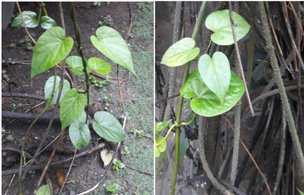
Fig. 2. Bush buck ( Gongronema latifolium )