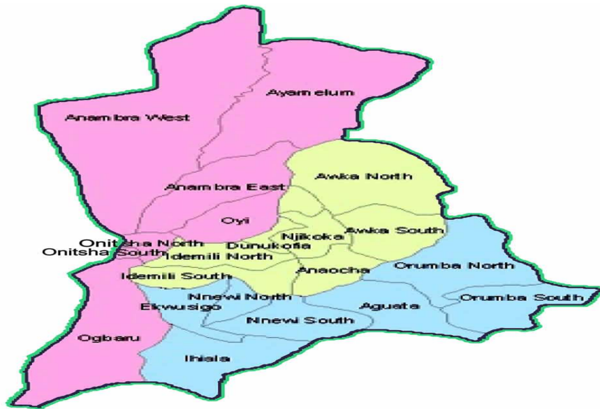
Fig. 1. Map of Anambra state