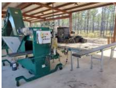
Figure 2. Automated Pot Fillers