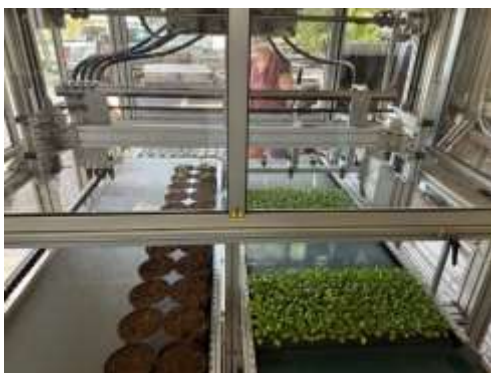
Figure 3. Pot Filling Advances

while an employee places a transplant within the container, which then moves down the line, and the remaining void space is filled with the second hopper, not only filling but filling and transplanting. This improvement is still low-tech but vastly increases the efficiency of the operation. Further technological advances have allowed for more precision filling of small containers, often in the form of plug cell trays, a plastic system with anywhere from 18 to 270 individual containers. These small-volume cells require significant precision to fill, as minor differences in filling uniformity can result in a major proportion of the void being filled improperly (Figure 3).