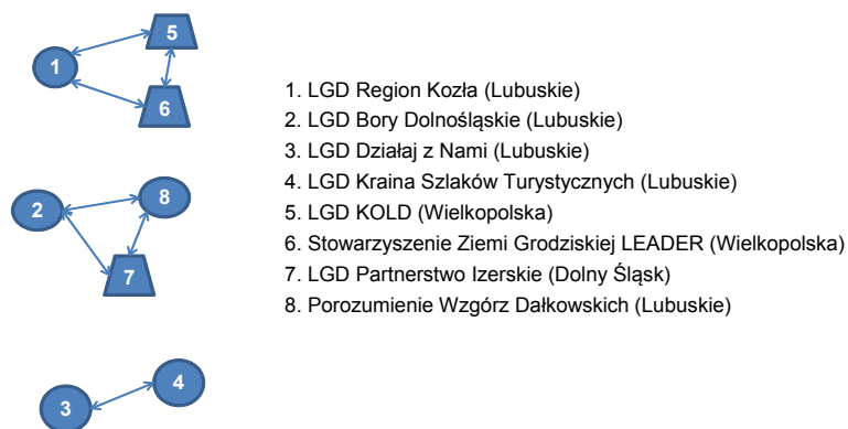
Fig. 1. Cooperation network of LAGs from Lubuskie

LAGs from Lubuskie cooperated with organisations from the same voivodeship and from Wielkopolska (LGD KOLD and Stowarzyszenie Ziemi Grodziskiej LEADER) and Dolny Śląsk (LGD Partnerstwo Izerskie) regions. They did not initiate international cooperation, although (due to the voivodeship being located at the border of the country) it could also be based on geographic proximity of LAGs (Fig. 1).