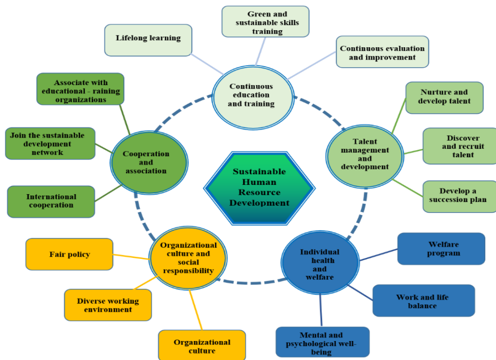
Figure 1. A proposed model for sustainable human resources development in Quang Ngai Province.

Proposed Model for Sustainable Human Resource Development: