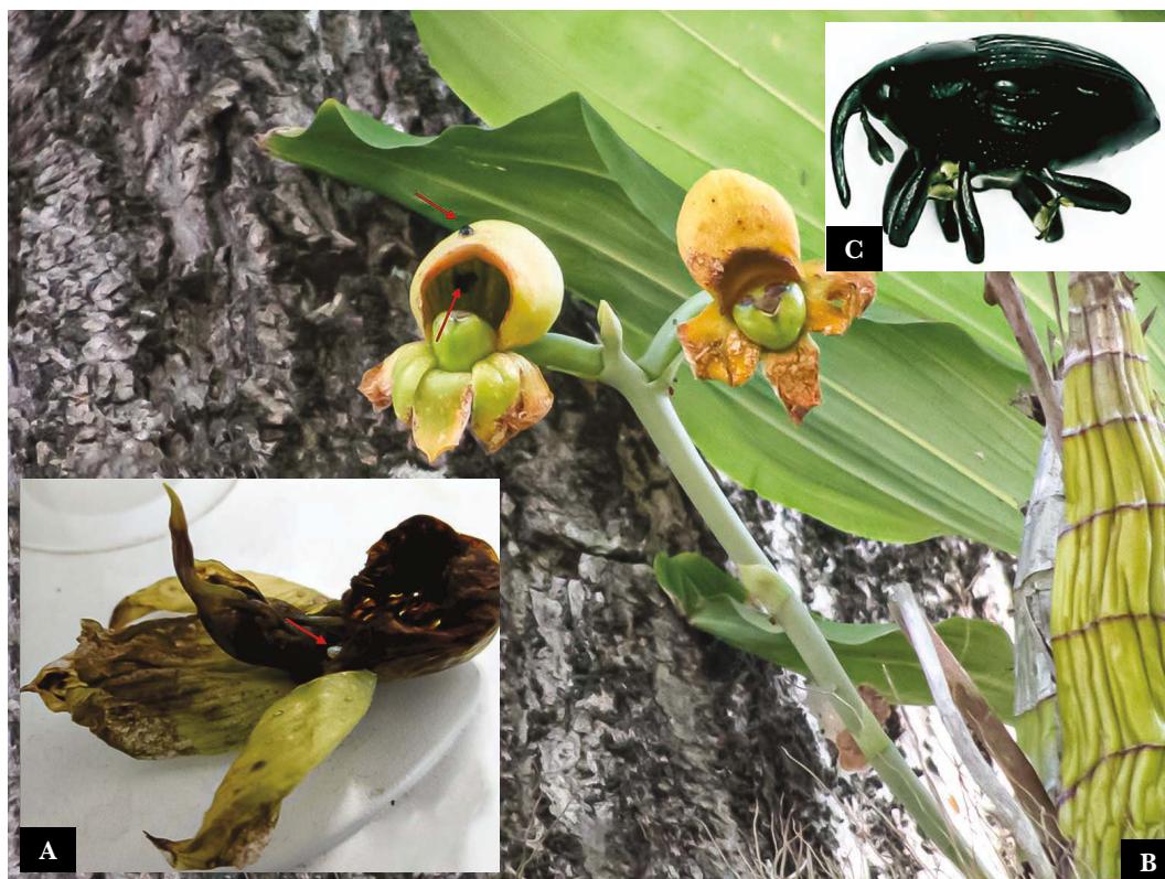
Figure 3. A) Flower of Catasetum integerrimum damaged by larvae of Stethobaroides nudiventris (the arrow points to a body part of the larvae). B) Flowers of C. integerrimum with damaged petals, and adults of S. nudiventris in a flower (signaled with the arrows). C) Female of S. nudiventris in lateral left view. Enclosure of Colegio de Postgraduados, Campus Tabasco.

(Figure 4C). November 17, 2021, one individual damaging the foliage of a Phalaenopsis sp. plant. January 27, 2022, two individuals scraping the foliage of a C. integerrimum plant.