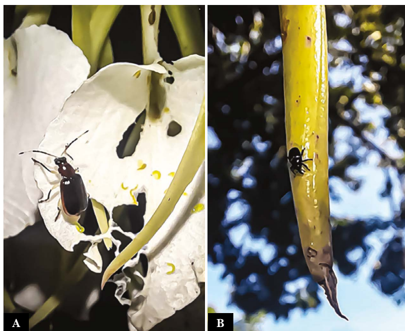
Figure 2. A) Adult of Diabrotica adelpha damaging a flower of Brassavola nodosa in Chicozapote 1 st Section. B) Adult of Stethobaris sp. damaging a flower bud of B. nodosa in the same locality.

Registry. Ejido Chicozapote 1 st Section: December 25, 2021, two adults damaging a flower button of a B. nodosa plant on the trunk of a Pachira aquatica Aubl. tree (Figure 2B). January 2, 2022, two adults damaging a flower of a B. nodosa plant on the trunk of