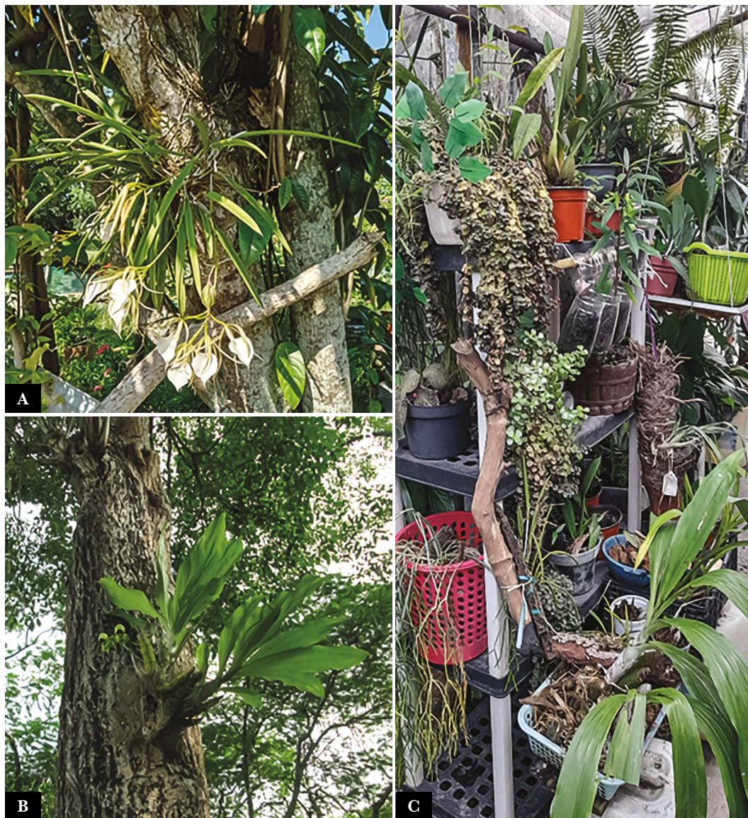
Figure 1. Partial view of the three gardens with orchid plants. A) Chicozapote 1 st Section. B) Enclosure of Colegio de Postgraduados, Campus Tabasco. C) City of Heroica Cárdenas.

of the mollusks by consulting studies by Auffenberg and Stange (1988), Caballero et al. (1991), Araújo and Bessa (1993), Herbert (2010) and Velázquez et al. (2014). The specimens were deposited in the collection of invertebrates associated to cultivated plants at Colegio de Postgraduados, Campus Tabasco. The species of orchids were identified in situ by consulting studies by Beutelspacher (2013) and Campos et al. (2019).