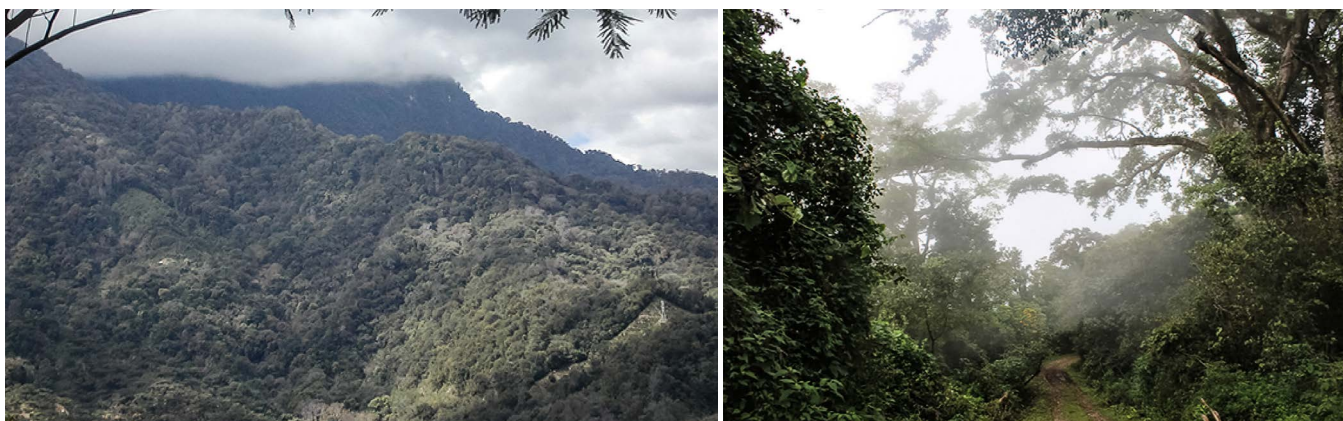
Figure 4. Tropical evergreen forest (left) and mountain mesophyll forest (right) are the ecosystems with more orchid species.

greatest epiphytes diversity is found in the medium-superior strata of trees, especially in the branches (García-González et al. , 2021).