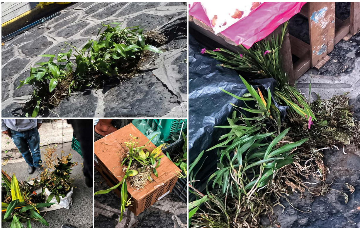
Figure 3. Orchids face several threats, including trafficking and illegal sale.

The flower is the most attractive part of orchids (Van Der Pijl and Dodson, 1966). Their beauty and the amazing morphological variation of their flowers have attracted the attention of scientists, botanists, growers, and nature photographers. However, many species are sought, looted, and trafficked by sellers, collectors, and people in general (Espejo-Serna et al. , 2002) (Figure 3). Compared to other plant families, orchid species face many threats