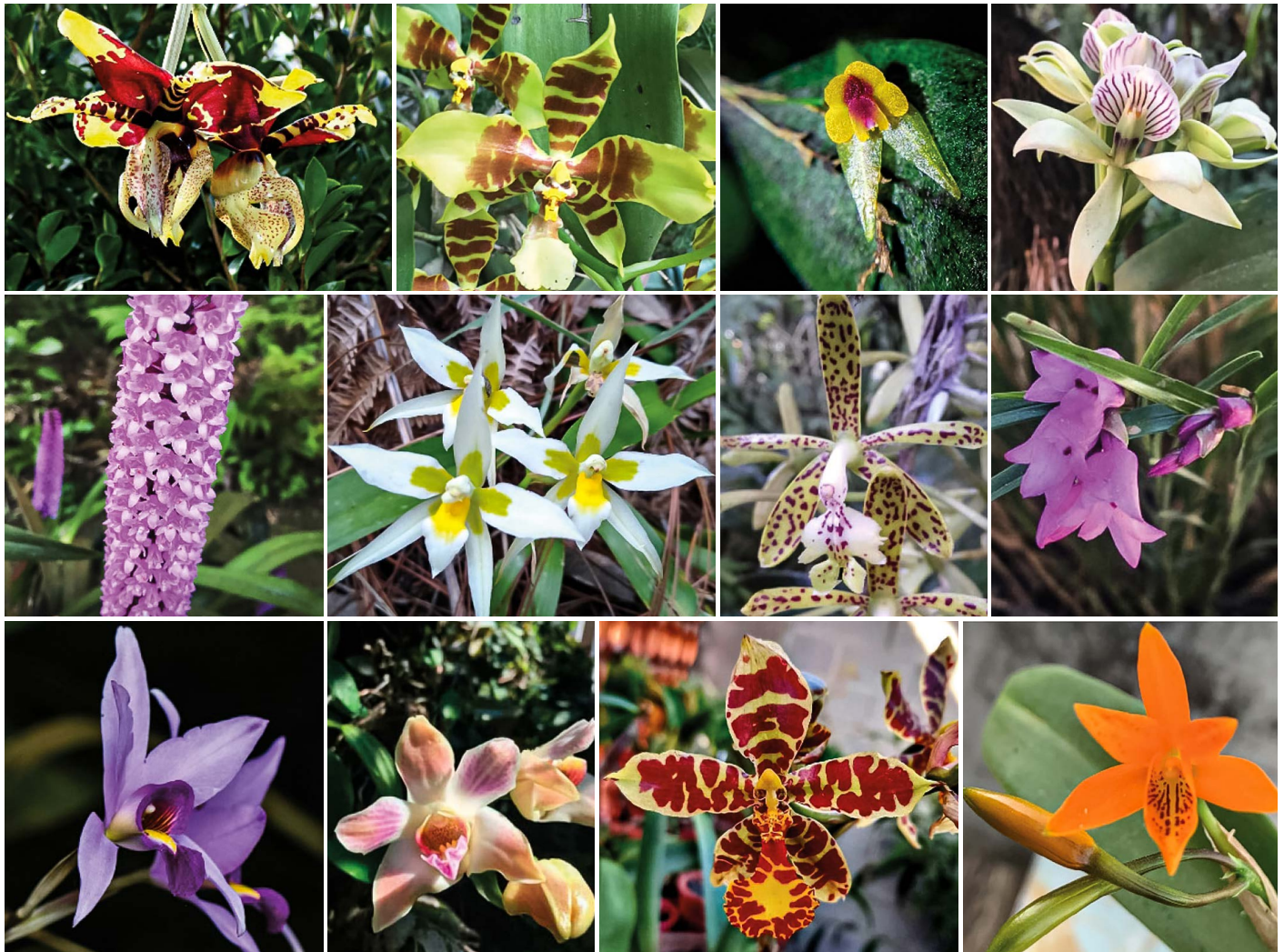
Figure 2. Orchid diversity in the mountain mesophyll forest (MMF) and tropical evergreen forest (TEF).

epiphytes develop a velamen, a special tissue that allows them to absorb water from the environment. These characteristics are a response to their eco-physiological adaptations, such as the range of light tolerance, temperature, and humidity (Krömer et al. , 2007). According to Benzing (1990), epiphytism, along with CAM photosynthesis, is the result of a set of adaptations developed to survive the conditions of the canopy. This has favored their expansion in the forest canopy, especially in the case of tropical forest orchids living in humid environments.