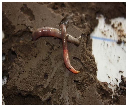
Figure 4. Exotic tropical earthworm Pontoscolex corethrurus .