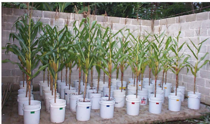
Figure 1. Effects of the native tropical earthworm Balanteodrilus pearsei on the growth of the corn crop. Trays with labels: Green=Soil+Legume Foliage+Earthworm; Blue=Soil+Legume Foliage; Red=Soil+Earthworm; Yellow=Soil+Earthworm.

chemical defenses against cell feeders (trips) by 31% and their resistance against trips by 81%. Both results were associated to earthworm abundance and diversity (Xiao et al. , 2017). Results suggest the need of a better integration of soil fauna into plant-herbivore interaction studies, both in applied and basic research. This opens up opportunities to explore the manipulation of soil organisms in agriculture or ecosystem restoration. Some groups can be promising agents for the improvement and protection of crop yield and can affect plant diversity on the soil at a community level, which allows the use of soil organisms to guide vegetation development (Wurst, 2013; Heinen et al. , 2018) (Figure 2,3,4,5).