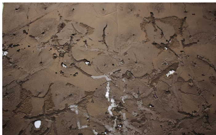
Figure 5. Construction of galleries and production of excreta of the exotic tropical earthworm Pontoscolex corethrurus .