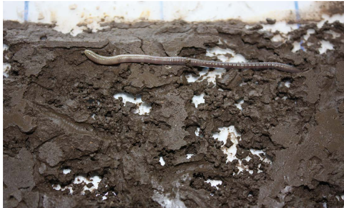
Figure 3. Construction of galleries and production of excreta of the native tropical earthworm Balanteodrilus pearsei .