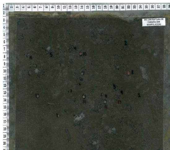
Figure 6. Cocoon and excreta production of the endogenous earthworm Pontoscolex corethrurus .