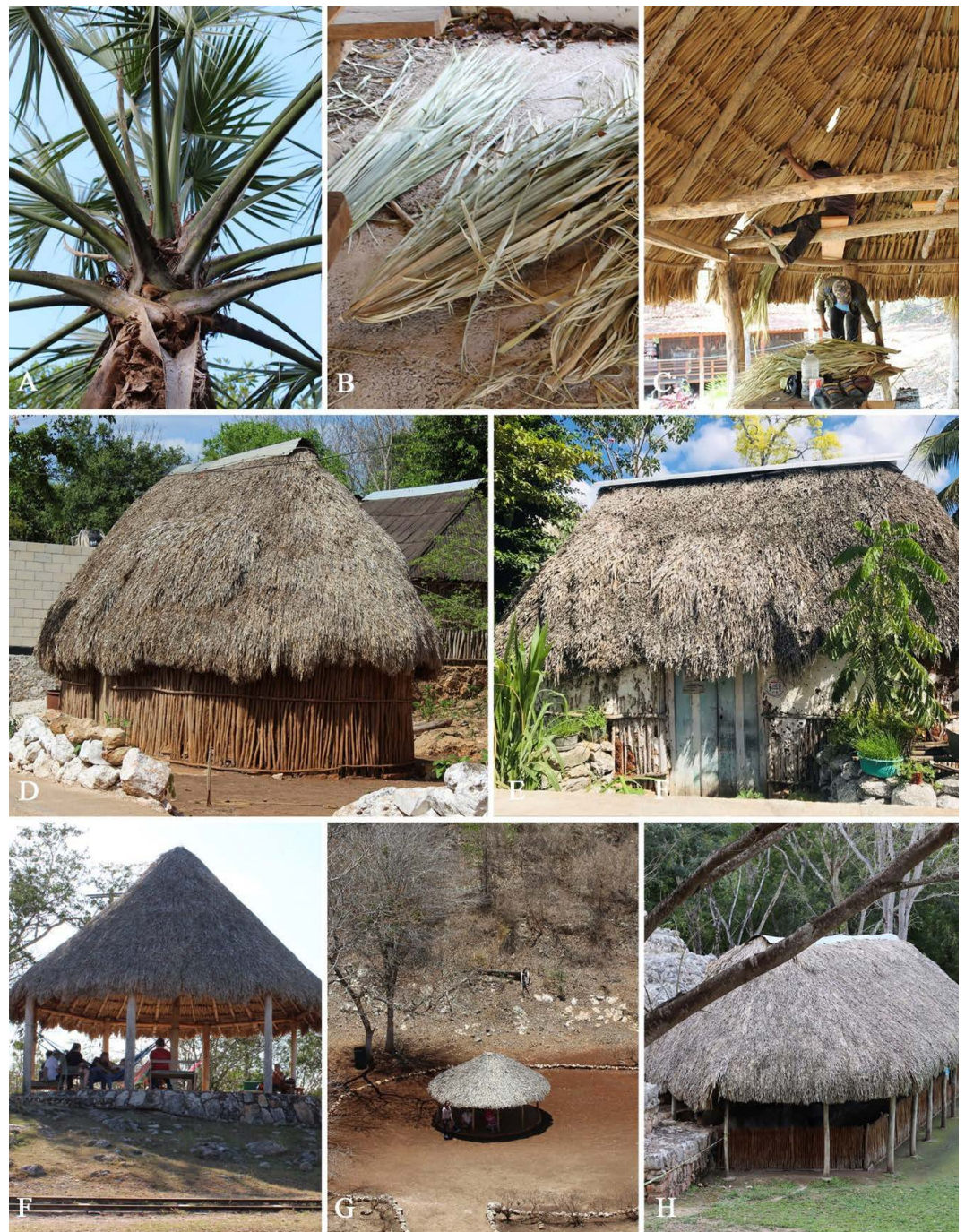
Figure 1. Uses of Sabal mexicana in the Yucatan Peninsula. A. Sabal mexicana . B. Huano Leaf. C. House construction. D-E. Houses with a huano roof. F. Palapa for tourism. G-H. Palapas to protect mayas stelae in archaeological zones.

At present, only some palm species have been spreading widely in the region, as a result of their ornamental potential. One of them is Roystonea regia , which is grown in most cities and piers, and whose wild populations are rare and little known. Governmental programs' nurseries should propose palms as a NTFP that can generate additional income,