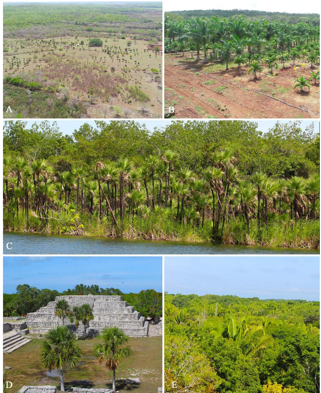
Figure 2. Arecaceae ecosystems in the Yucatan peninsula, Mexico. A. Deforested areas for crops where they keep Sabal mexicana in Hopelchén, Campeche. B. Cultivation of Roystonea regia in Xamantún, Campeche. C. Acoelorrhaphe wrightii in its natural habitat, Río Hondo, Quintana Roo. D. Sabal yapa populations conserved in the archaeological zone of Xampú, Yucatán. E. Attalea guacayule populations conserved in the archaeological zone of Kohunlich, Quintana Roo.