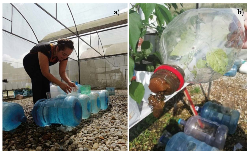
Figure 3. a) Section of the seedling support and b) Seedling in the support.

The results were encouraging after the end of the growing and irrigation period, up to 98% of the water was saved. Only 60 L of nutrient solution were used to grow 20 plants, while the traditional hydroponics reference system spent an average of 264 L per week for 13 weeks (total: 3440 L). One concern at this point is that, to maintain enough humidity