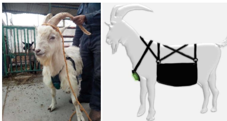
Figure 3. A Sannen buck wearing and apron and harness to avoid copulation and to identified ewes in estrus.