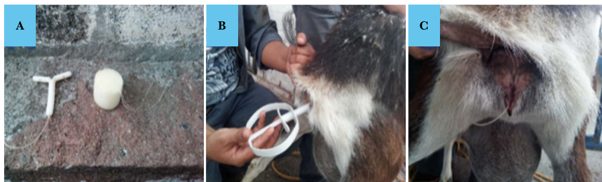
Figure 2. (A) Picture depicting a CIDR and sponge used in goats to estrus synchronization. (B) The CIDR and sponge are intravaginally inserted into the animal. These vaginal inserts have a tail that normally remains exteriorized after their application. (C) The removal of the CIDR and sponge is carried out by pulling out their protruding tail; if a goat shows not protruding tail of the vaginal inserts, a vaginal examination by speculum is recommended to ensure that they are not located deep into the vagina.

many pre-ovulatory follicles. The eCG has a similar action to the FSH; the objectives of its application, according to the injected dose, are to increase the number of pre-ovulatory follicles and the homogenization of the appearance of estruses. The estrus in does takes place between 26 and 47 h after the withdrawal of the sponge or CIDR (Navanukraw et al. , 2014) and it shortens even more the time with the application of the eCG.