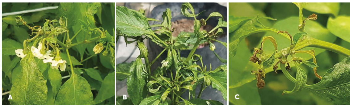
Figure 2. Symptoms of damage in vegetative shoots (A), mature leaves (B) and flower buds (C) in apaxtleco chili pepper.