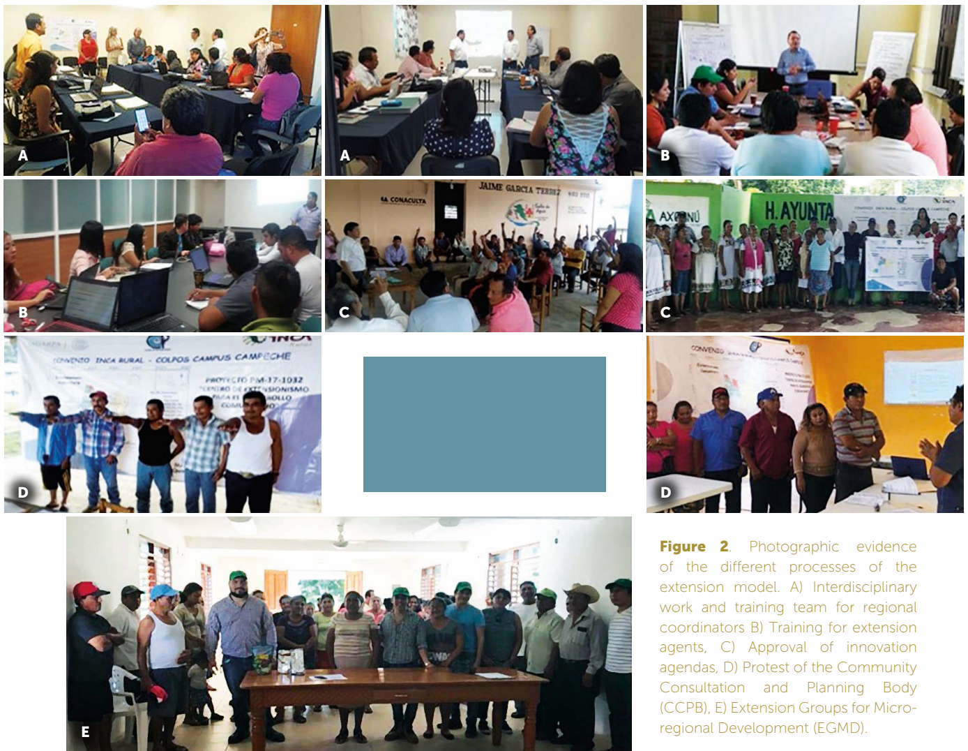
Figure 2. Photographic evidence of the different processes of the extension model. A) Interdisciplinary work and training team for regional coordinators B) Training for extension agents, C) Approval of innovation agendas, D) Protest of the Community Consultation and Planning Body (CCPB), E) Extension Groups for Micro-regional Development (EGMD).