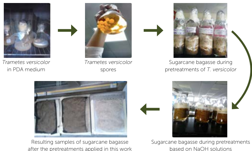
Figure 1. Pretreatment process applied to sugarcane bagasse ( Saccharum spp.).

An inoculum of Saccharomyces cerevisiae was prepared for simple fermentation of the saccharified samples. For this, it was necessary to seed fresh commercial yeast in an agar medium of yeast extract (10 g L -1 yeast extract,