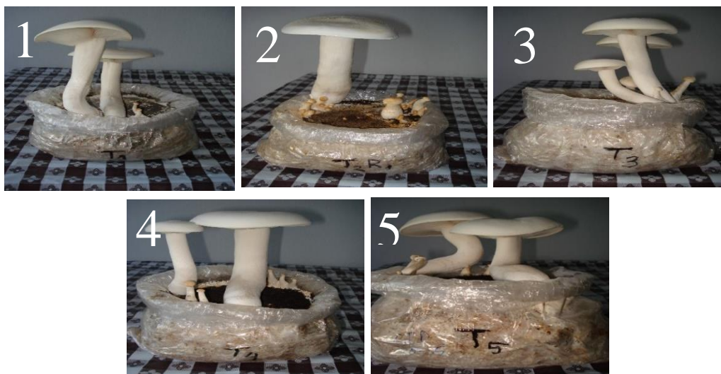
Fig. 3. Fruiting bodies at different treatment during 1 st harvest, T 1 : Control (Loam soil + Sand, 3:1) (farmer's practice), T 2 : SMS compost + Sand (3:1), T 3 : Loam soil + SMS compost + Sand (2:1:1), T 4 : Loam soil + SMS compost + FYM (1:1:1) and T 5 : SMS compost + FYM (1:1).

Biological and economic yield of milky white mushroom: Biological and economic yield of milky white mushroom was markedly influenced by casing mixture of SMC with sand, soil and FYM (Table 2). The maximum yield was obtained from treatment T 4 (biological yield 329 g packet -1 and economic yield 316g packet -1 ) which was statistically similar to treatments T 2 (biological yield 312 g packet -1 and economic yield 299 g packet -1 ) and T 3 (biological yield 318 g packet -1 and economic yield 304 g packet -1 ). The