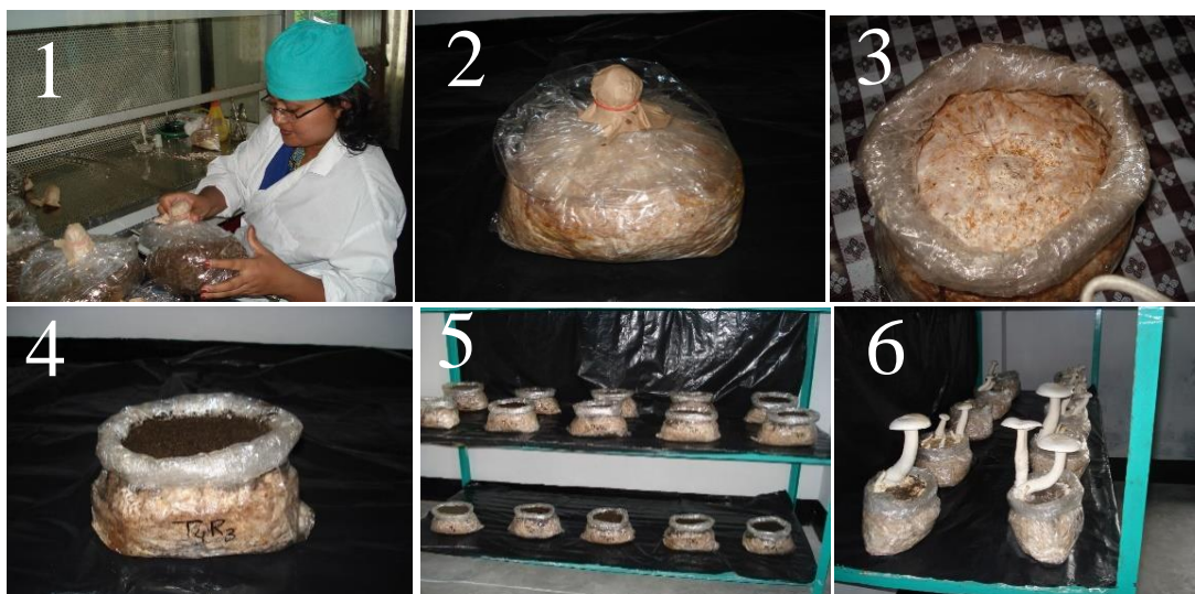
Fig 1. Different steps of milky white mushroom production ((1) Spawn packet preparation, (2) After completion of mycelial colonization, (3) Preparation for casing, (4) Casing (5) Pinhead formation and (6) Fruiting body formation

Harvesting: Fruiting bodies were harvested when the pileus was fully opened. Harvest was done by twisting the mushroom at its base. After obtaining the first harvest, the casing medium was gently ruffled, slightly compacted back and sprayed regularly with water. The second and third harvests were done as the first harvest. Data were collected on the number of days required for the initiation of primordia, the number of days required for the 1 st harvest & total harvests, number of effecting fruiting bodies per packet, biological yield, economic yield, length of stalk, diameter of stalk, diameter of pileus and thickness of pileus.