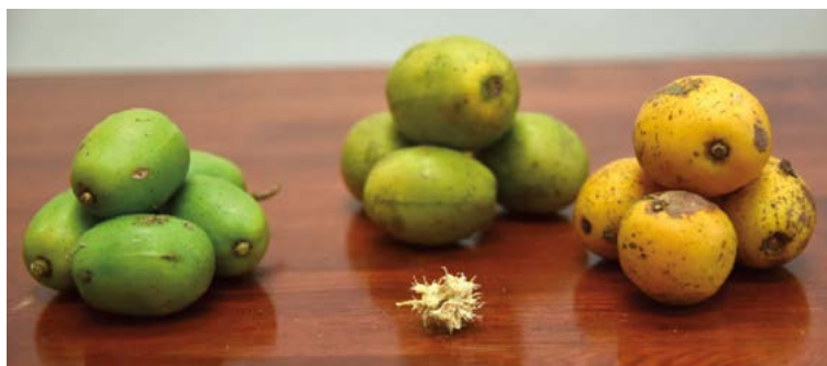
Figure 1. Spondias dulcis fruits (green, seasoned and ripe), and seeds (in front of fruits).

Data recording was conducted from April to June 2023. The propagation by cuttings was repeated (in the second block of stem cuttings) in the same way as it was done with Block 1. But this time the stems were obtained from the 8-year-old tree and were grouped into five lots (average diameters 3.6, 1.92, 1.74, 1.7, and 1.16, cm), following the criteria already described. This time, stem cuttings were introduced in a solution (200 g in 20 L of water) of a commercial stimulant for roots emission (Raizal ® 400) for 10 minutes. In addition, according to the specifications of the product, each nursery bag was irrigated