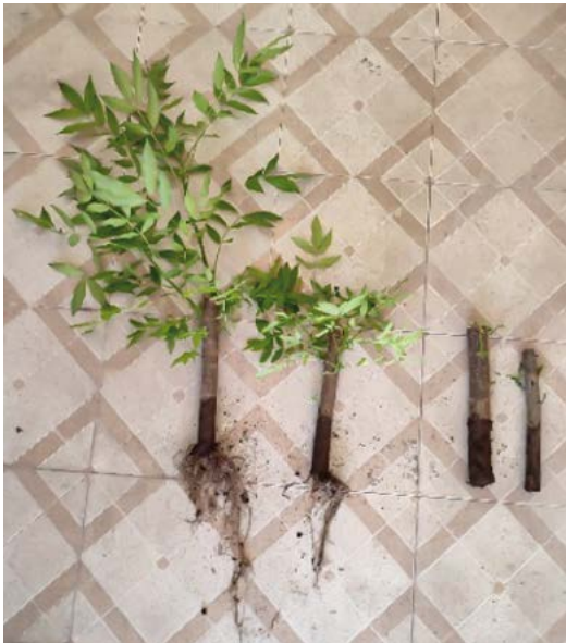
Figure 7. Spondias dulcis stem cuttings with good vegetative growth which also formed abundant roots; in contrast to those who showed poor vegetative development.