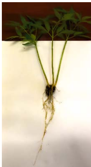
Figure 3. Three Spondias dulcis seedlings which emerged from only one seed.

variable; some emerged up to 20 days after the first seedling emerged. The height and vigor of the plants originated from the same seed were also different.