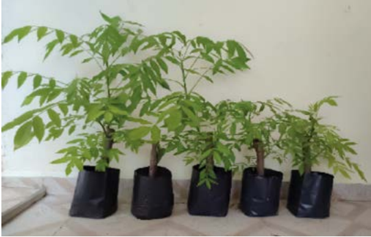
Figure 5. Four out of five stem cuttings of Spondias dulcis exhibited good vegetative growth.