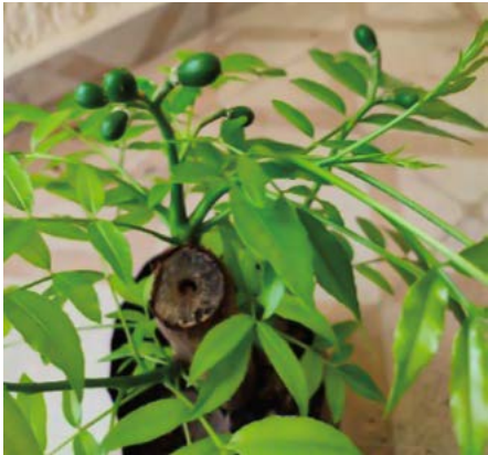
Figure 6. Spondias dulcis fruits developed in one of the cuttings.