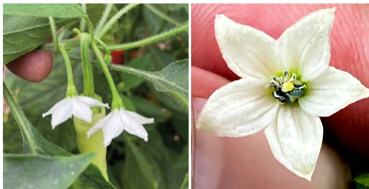
Figure 4. Position of the hanging flower and Ya'ax ik chili pepper flower.