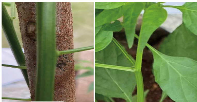
Figure 2. Shape of the plant stem and absence of anthocyanins in the knots.

domestication, which reduces its physiological and adaptive growth capacity under the environmental conditions of regulation of high radiation, which is related to hydric economy and gas diffusion, as pointed out by Molina-Montenegro (2008).