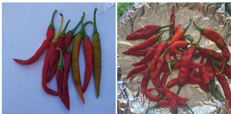
Figure 5. Ya'ax ik chili pepper fruits in mature state.

The Ya'ax ik chili pepper fruits showed absence of anthocyanin spots, fruit color in intermediate orange stage, high setting, red coloring, without flowering vestiges. Long fruits with semi-coarse epidermis with placenta distributed along the fruit were observed, green in the early stage and red in maturity; the shape of the fruit in union with the obtuse