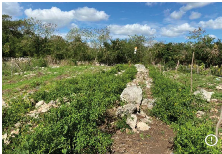
Figure 1. Plantation of Ya'ax ik chili pepper in the rural communities of the state of Yucatán.

and tiered emergence of the plant through the substrate, requiring more time for the establishment of the seedlings in the trays.