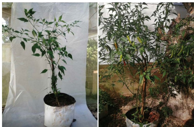
Figure 3. From left to right: Ya'ax ik chili pepper plant under protected system and open air.

The leaf density and ramification was intermediate, which can partly explain the plant's tolerance to drought, from the reduction of the leaf surface exposed to transpiration and therefore the water loss, in addition to the smaller size of its leaves, compared to the leaf size of chile dulce (11.35/5.72 cm) and Rosita habanero chili (14.78/77.64 cm), regarding the length and width rate of the leaf. This type of chili pepper under field conditions is cultivated in various types of soil, even in stony soils, where it adapts very well and the morphological characteristics of the plant make it adaptable to conditions of association crops and at the same time it can modify its expression with another type of management.