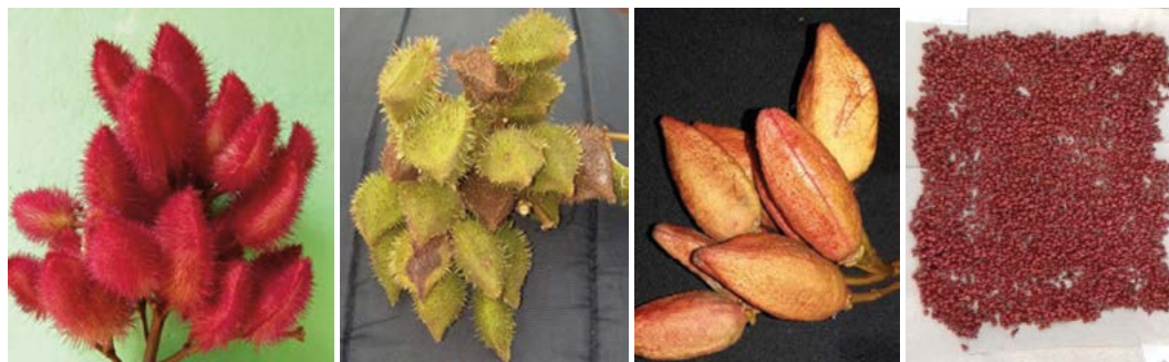
Figure 1. Annatto samples and seeds collected in two communities in Cunduacán, Tabasco.

placed in paper bags with a capacity of 500 g and labeled; each sample weighed approximately 200 g. These were taken to the Campus Tabasco del Colegio de Postgraduados where they were analyzed in the Animal Science Laboratory and Central Laboratory.