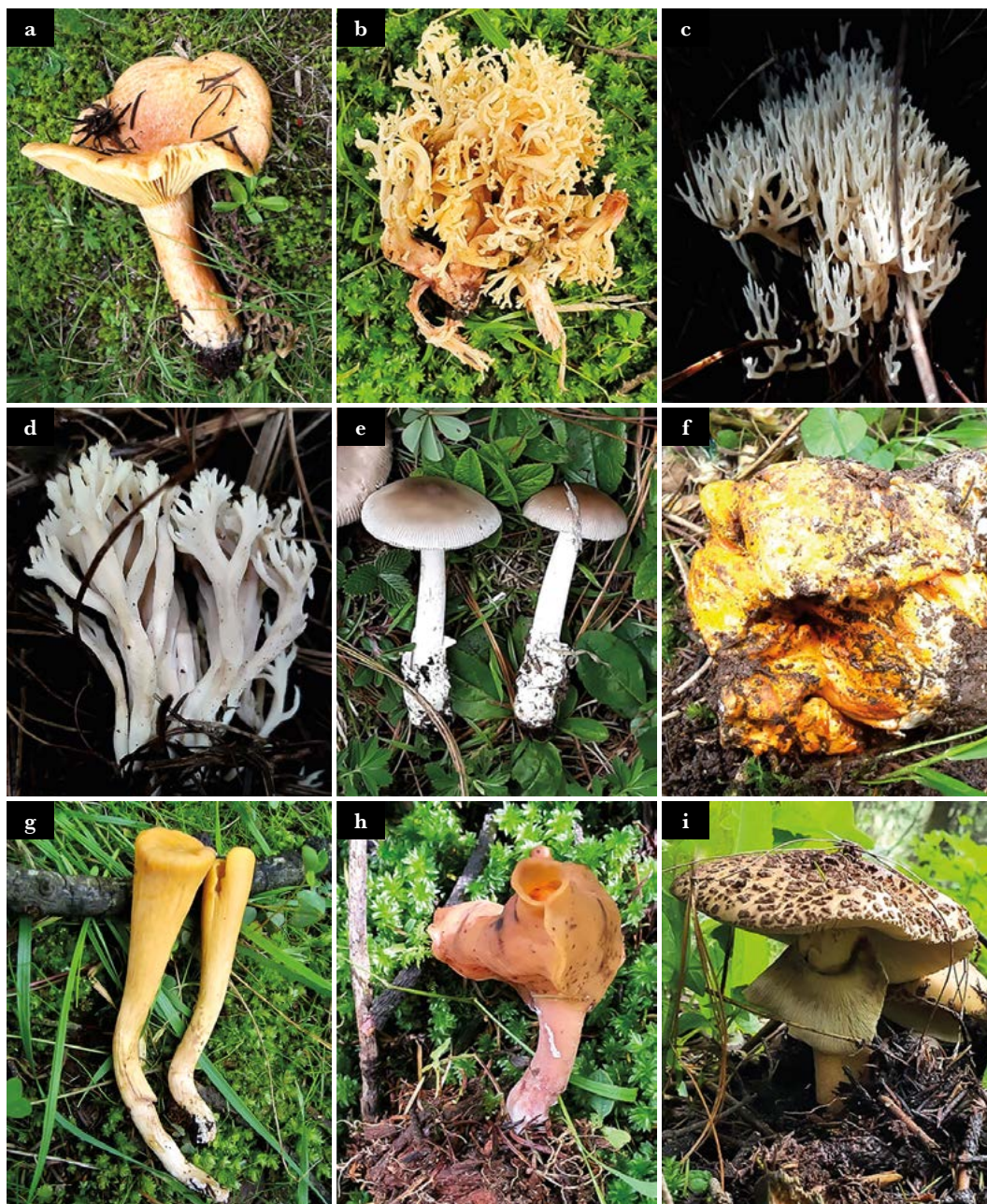
Figure 2. Wild edible mushrooms consumed in Santa Ana Jilotzingo: a) Lactarius deliciosus (enchilado=seasoned with chili); b) Ramaria sp. (patita de pájaro=bird's little leg); c) Phaеоclavulina sp. ("ixlitos"); d) Clavulina cinerea ("ixlitos"); e) Amanita vaginata ("comal"); f) Hypomyces lactifluorum (trompa de cochino=pig's trunk); g) Clavariadelphus truncatus (chichi de vaca=cow udder); h) Gyromitra infula ("chamacuero"); and i) Amanita aff. novinupta ("solis").

represent a greater biocultural abundance than other areas of central Mexico (Domínguez-Romero et al. , 2015; Montoya et al. , 2019). Forty-nine percent of the 99 traditional names documented in Santa Ana Jilotzingo belong to simple primary names given by the shape of some object, such as comales (griddle), panalito (honeycomb), mazorca (corn cob), or