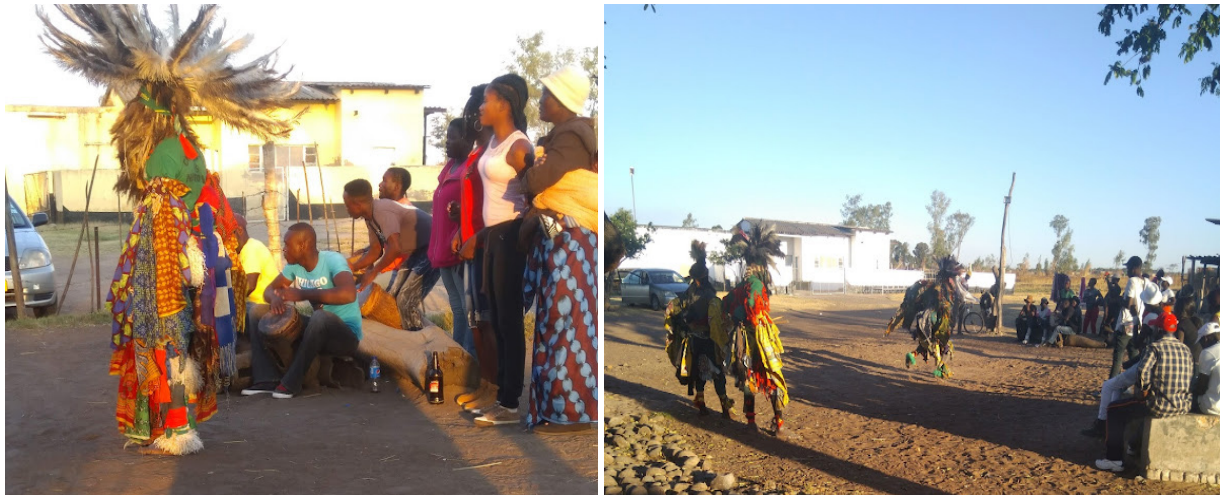
Figure 7: Nyau Cult gatherings in Lydiate before the COVID-19 pandemic

mental health and well-being during times of crisis. At Lydiate informal settlement, the pandemic drastically reduced access to social and cultural practices like religious gatherings and the Nyau cult practices that are very important for maintaining a sense of community and identity among Lydiatians. Figure 7 shows Nyau Cult gatherings in Lydiate before the COVID-19 pandemic.