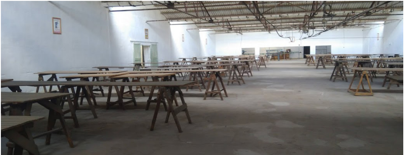
Figure 6: Empty Tobacco grading shade at Lydiate during the COVID-19 pandemic