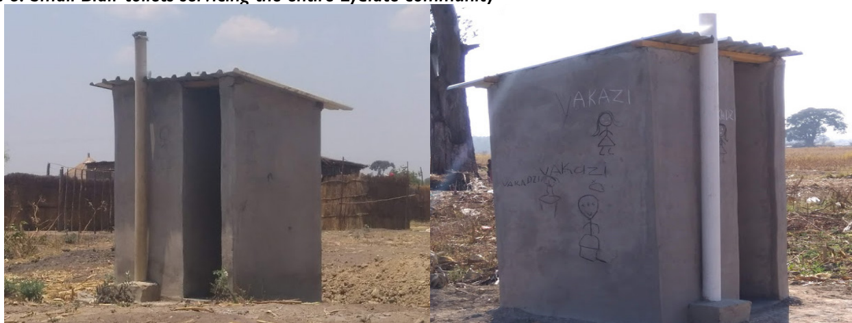
Figure 8: Small Blair toilets servicing the entire Lydiate community

Migrants living in informal settlements often lack access to basic services, including clean water and sanitation facilities (Bhanye, 2023c; Matamanda, 2020). The COVID-19 pandemic exacerbated this problem, making it even more challenging for vulnerable communities like Lydiate to maintain their health and well-being. During the study, respondents revealed that limited access to clean water and sanitation facilities increased the risk of infections, including diarrheal diseases, leading to malnutrition, particularly in children. Figure 8 shows two small Blair toilets servicing the entire Lydiate community.