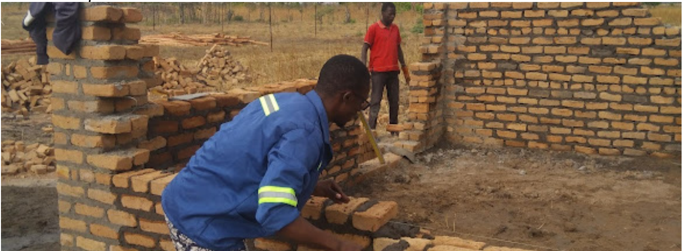
Figure 4: The researcher working on a building project with some migrants from Lydiate informal settlement before the COVID-19 pandemic

Figure 4 shows the researcher working on a building project with some migrants from Lydiate informal settlement before the COVID-19 pandemic halted their employment. The building project was for a poultry farmer who owned an agro-residential plot adjacent to Lydiate informal settlement.