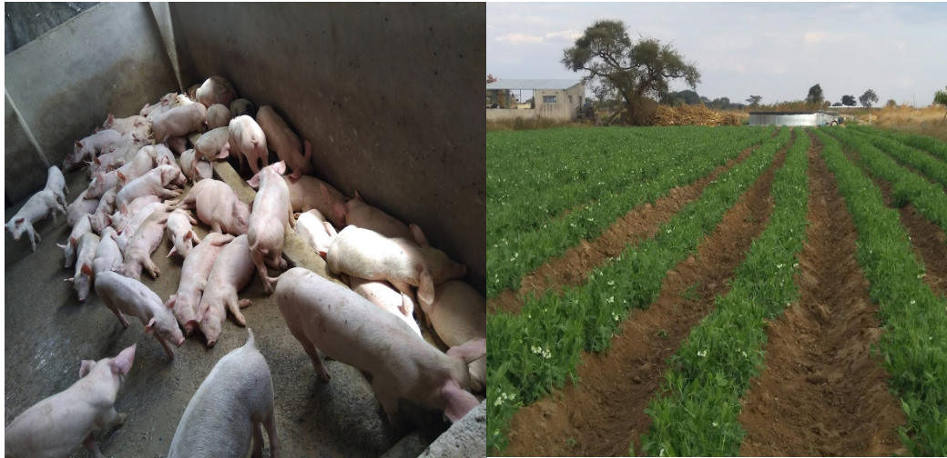
Figure 3: Farming activities (livestock and crop production) at nearby farms where Lydiatians often find employment

Figure 3 shows farming activities (livestock and crop production) at nearby farms where Lydiatians used to find employment before the COVID-19 pandemic and bans on associational life.