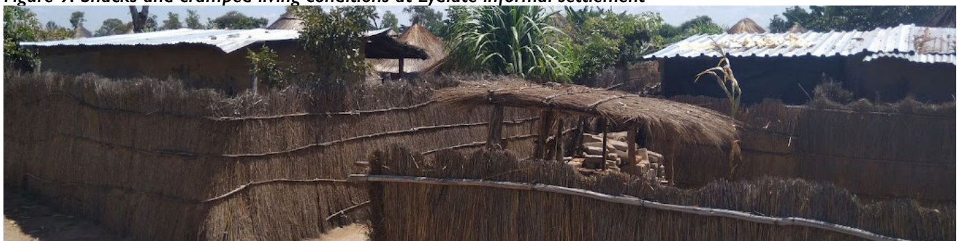
Figure 9: Shacks and cramped living conditions at Lydiate informal settlement

Poor housing conditions, including overcrowding and inadequate ventilation, are significant challenges faced by migrants living in informal settlements, further compounded by the COVID-19 pandemic. Overcrowding and inadequate ventilation at Lydiate informal settlement increased the risk of infections and impacted the health and well-being of migrants, including their food security. Overcrowding is a significant problem at Lydiate informal settlement, where multiple households often share a single room or living space. This increased the risk of infectious diseases such as COVID-19, as the virus could easily spread in crowded living conditions. Figure 9 shows shacks and cramped living conditions at Lydiate informal settlement