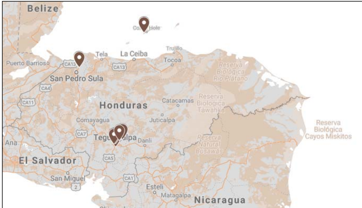
Figure 3. Location of the Research