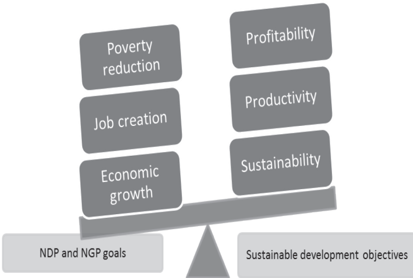
Figure 2: The tension between the NDP and NGP goals and sustainable development objectives.

The NGP calls for political reform as a necessary co-requirement for economic growth and transformation and greater coordination between government departments and reform of public institutions to increase competition, develop skills and improve efficiency. Unlike the overly ambitious NDP, which hopes to eliminate poverty by 2030, the NGP at least takes cognisance of important trade-offs such as: