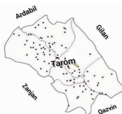
Figure 1. Tarom County Location

To ensure an adequate sample size for the study, the researcher initially identified two experts using targeted sampling methods. Subsequently, using snowball sampling techniques, this number was increased to 40. Going forward, it is planned to continue increasing the sample size until reaching theoretical saturation limits. The use of snowball sampling methods will be employed to achieve this goal. This approach will allow us to capture a broad range of perspectives from across our diverse statistical population while ensuring that our research is both comprehensive and robust.