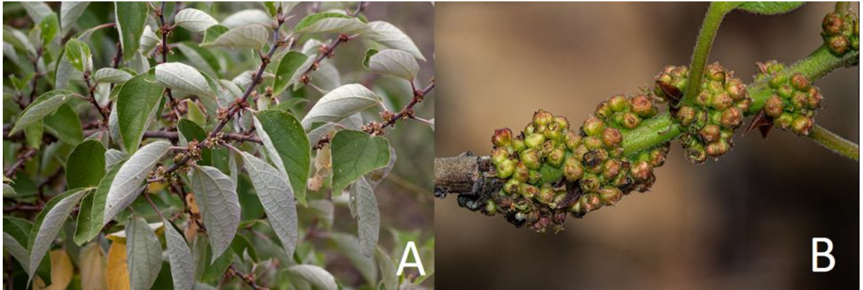
Figure 1: Pouzolzia mixta A: branch showing discoloured leaves and flowers, and B: branch showing fruits

medicinal, fibre, vegetable, fodder and ornamental plant species [20]. It is, therefore, within this context that the current study was undertaken aimed at documenting the biological and medicinal properties of P. mixta .