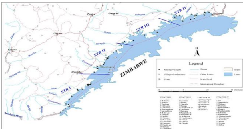
Figure 2: Map of Lake Kariba showing the four strata.

This survey was conducted in three areas: Stratas I, II and IV of Lake Kariba based on the geographical and ecological characteristics and limnologic structure of the lake [8, 11, 17]. Data were collected in the Sinazongwe, Siansowa and Siavonga areas of Zambia. These were picked because they had well-defined fishing villages and easy access. The fisheries research station is located in Sinazongwe adjacent to the shores of Lake Kariba, which has a population of ~100,000 [18].