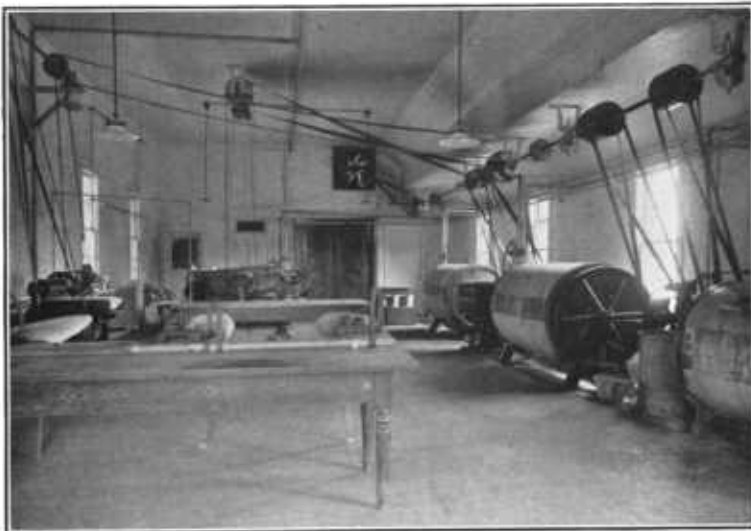
FIG. 2.—GENERAL VIEW OF THE INTERIOR.