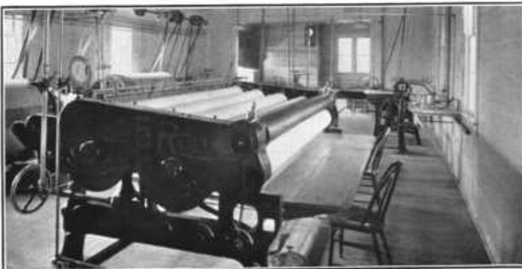
FIG. 3.—THE MANGLE.