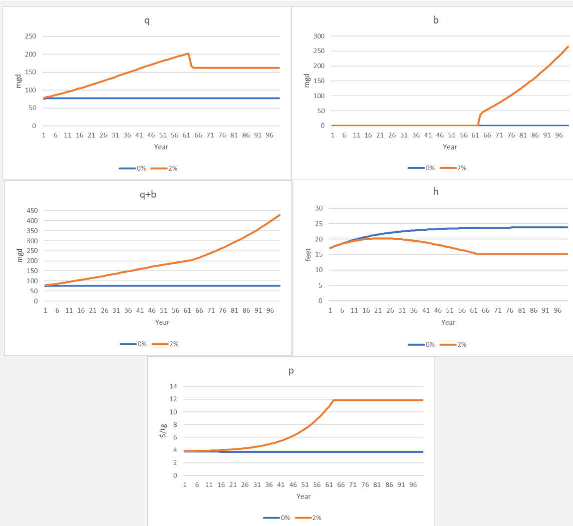
Figure 5: Optimal Trajectories for Groundwater Extraction, Desalination, Total Water Consumption, Efficiency Price, and Head Level for the Cases of 0 Percent and 2 Percent Annual Demand Growth