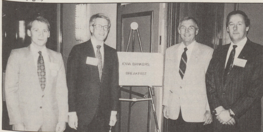
Hungry Iowa Bankers