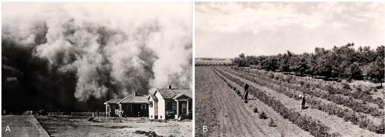
Figure 3. (A) A giant dust storm rolls across eastern Colorado during the 1930s. (B) Landowners tending to their windbreak planted with the Prairie States Forestry Project.