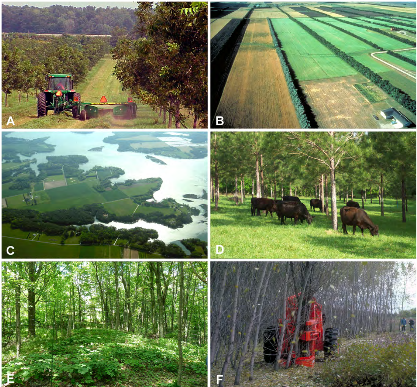
Figure 1. Five main categories of agroforestry practices are used in the United States: (A) alley cropping, (B) windbreaks, (C) riparian forest buffers, (D) silvopasture, and (E) forest farming. An emerging sixth category is (F) special applications (e.g., short-rotation woody crops).

across the length of the Great Plains (fig. 3). Nearly 220 million seedlings were planted, creating 18,600 miles of windbreaks occupying 240,000 acres on 30,000 farms (Williams 2005).