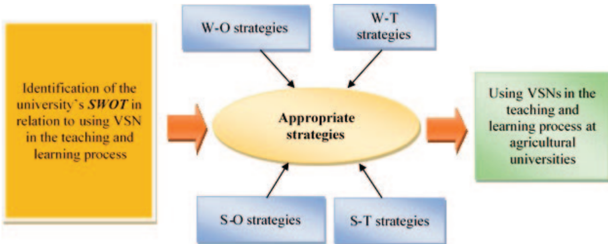
Figure 1. The research conceptual framework

tively. In terms of gender were male (84.4%). In terms of academic rank, 51 percent were assistant professors, 39 percent were associate professors, and the rest were professors. To present comprehensive findings and de-