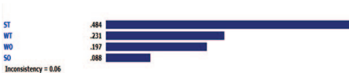
Figure 3. The weight and ranking of SO, ST, WT, and WO strategies to integrate VSNs in the teaching and learning process