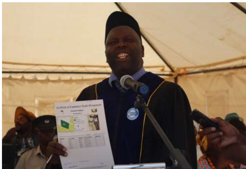
Photo 4: His Royal Highness Chief Chamuka VI displays a 'joint certificate' during the issuance ceremony in 2018

Another notable outcome is of the emergence of development planning guided by the spatial and social economic information that has empowered the community to engage relevant stakeholders. With the government implementing the decentralization policy, communities in Chamuka are well equipped with information necessary to drive their own development. The STDM process has provided invaluable information, profile and enumeration reports and spatial visualizations that are an empirical resource base to fully comprehend the developmental constraints and opportunities, which exist in the respective villages. Through this community led process, the residents can articulate their priorities and the course of interventions they would want to pursue. The digital databases created can be easily manipulated for updating the information pertaining to individual landowners and land parcels.