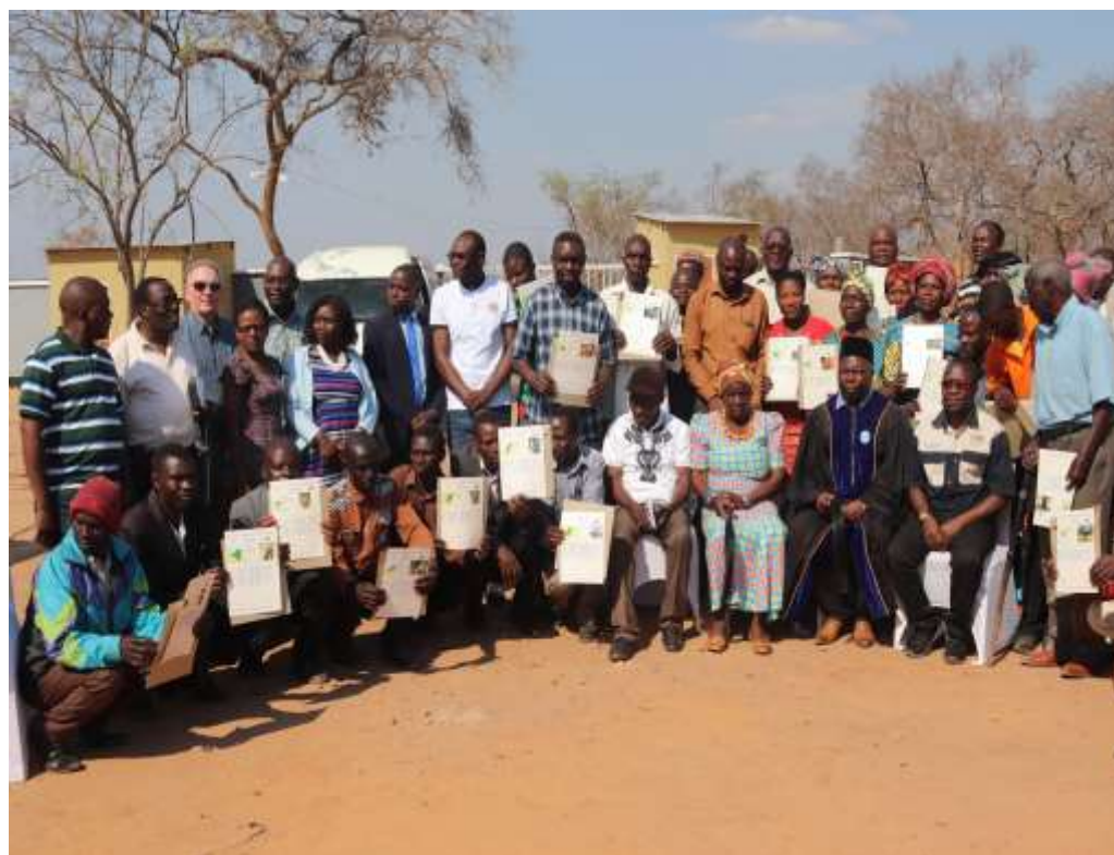
Photo 3: Beneficiaries of customary land certificates and stakeholders pose for a photo during the handover ceremony in September 2018

and 1,542 (43%) are men. The tenure documents have empowered the villagers and protected their interests on these lands, which they depend on for their basic livelihoods. The community is now able to negotiate with investors regarding the development of their land. For instance, in Bulemu village, seven families occupying a 103-hectare piece of land have negotiated a 25-year lease with an Israeli firm for a solar project. using the certificates as proof of occupation. This agreement will see these households benefit from the solar energy at no cost for the next 25 years. Each household will further benefit from sharing in the earnings. Also, the local community will acquire skills on how to operate the solar.