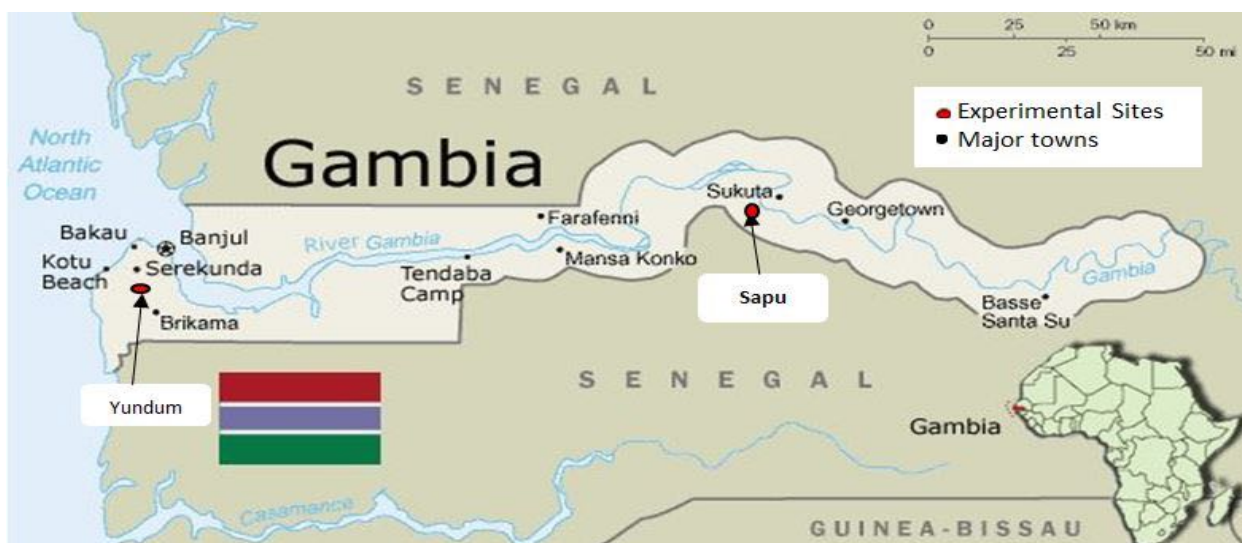
Figure 1: The location of the two study sites in The Gambia (Yundum and Sapu)