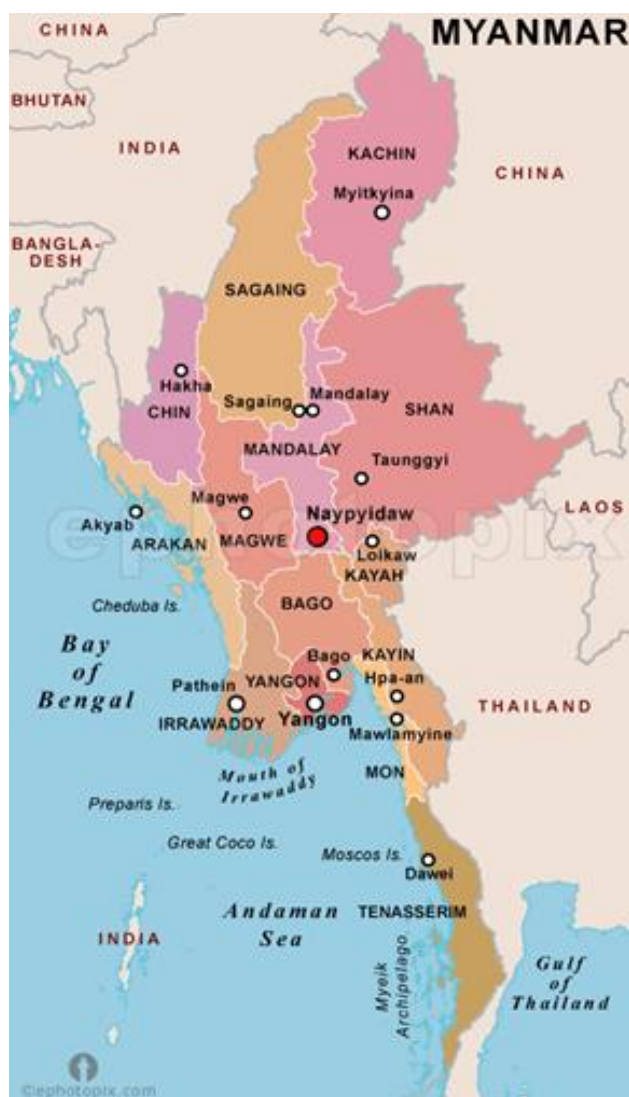
Figure A: Map of Myanmar's states and regions