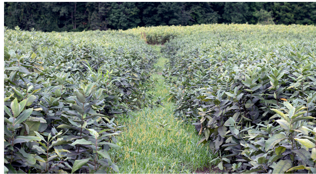
▲ Established milkweed stand at Borderview Farm

Roger Rainville stated that common milkweed monoculture establishment costs are similar to corn as he used the same equipment, inputs and operations. The only difference was the seed. Based upon ERS Corn Cost of Production values, Table 1 shows estimates of the cost of establishing a pure milkweed stand and an average annual cost for comparing any potential returns. While corn is an annual crop, milkweed is a perennial crop; establishment costs can be averaged over the 7-year assumed life of the milkweed crop. Average costs of growing and harvesting milkweed over 7 years are estimated to be $567 per acre per year.