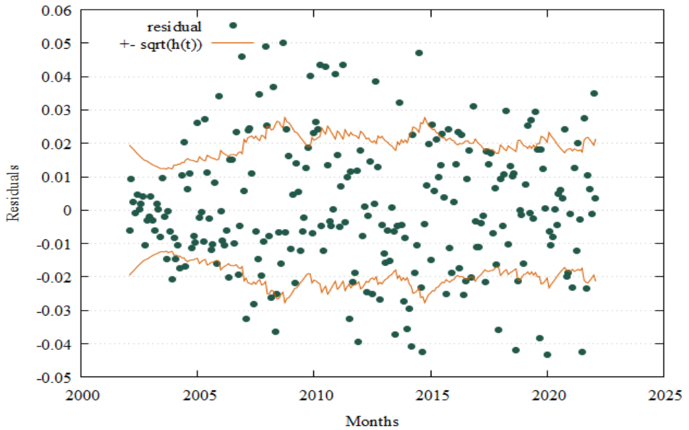
Figure 2. Residual form GARCH Model for Retail Broiler Price Model