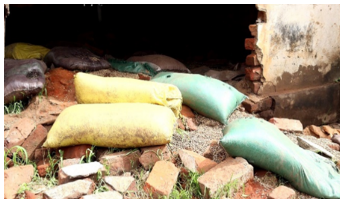
Figure 2. Bags of maize destroyed by floods in Chikwawa District